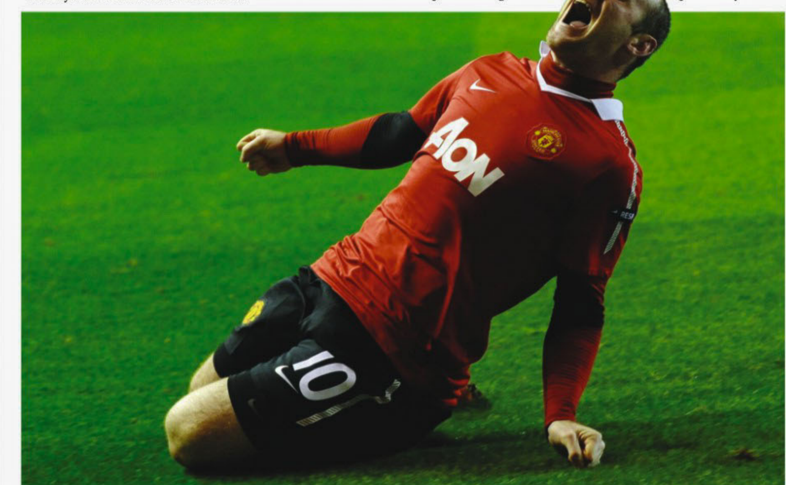
Manchester United star Wayne Rooney is ecstatic after scoring a penalty against Rangers during their Champions League encounter at Ibrox on Wednesday.

"It will always be difficult to try and judge how we can do because we are in a situation where injury and suspension could affect us quite badly."