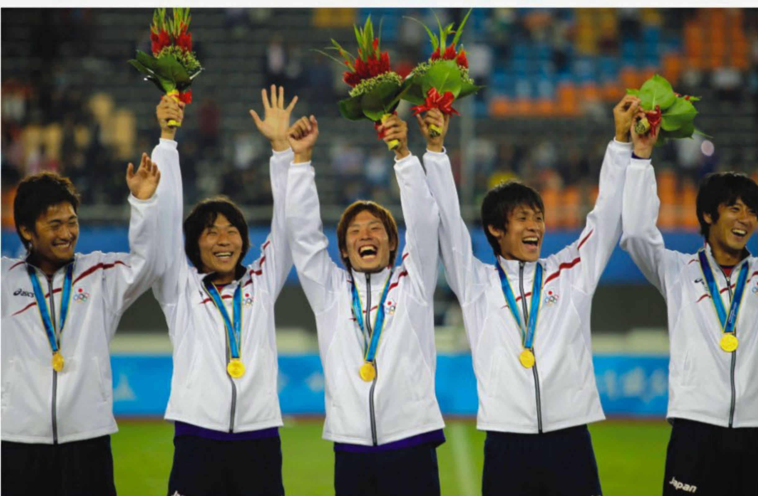
Members of Japan football team celebrate with their gold medals after defeating the United Arab Emirates in the final of the 16th Asian Games in Guangzhou yesterday.