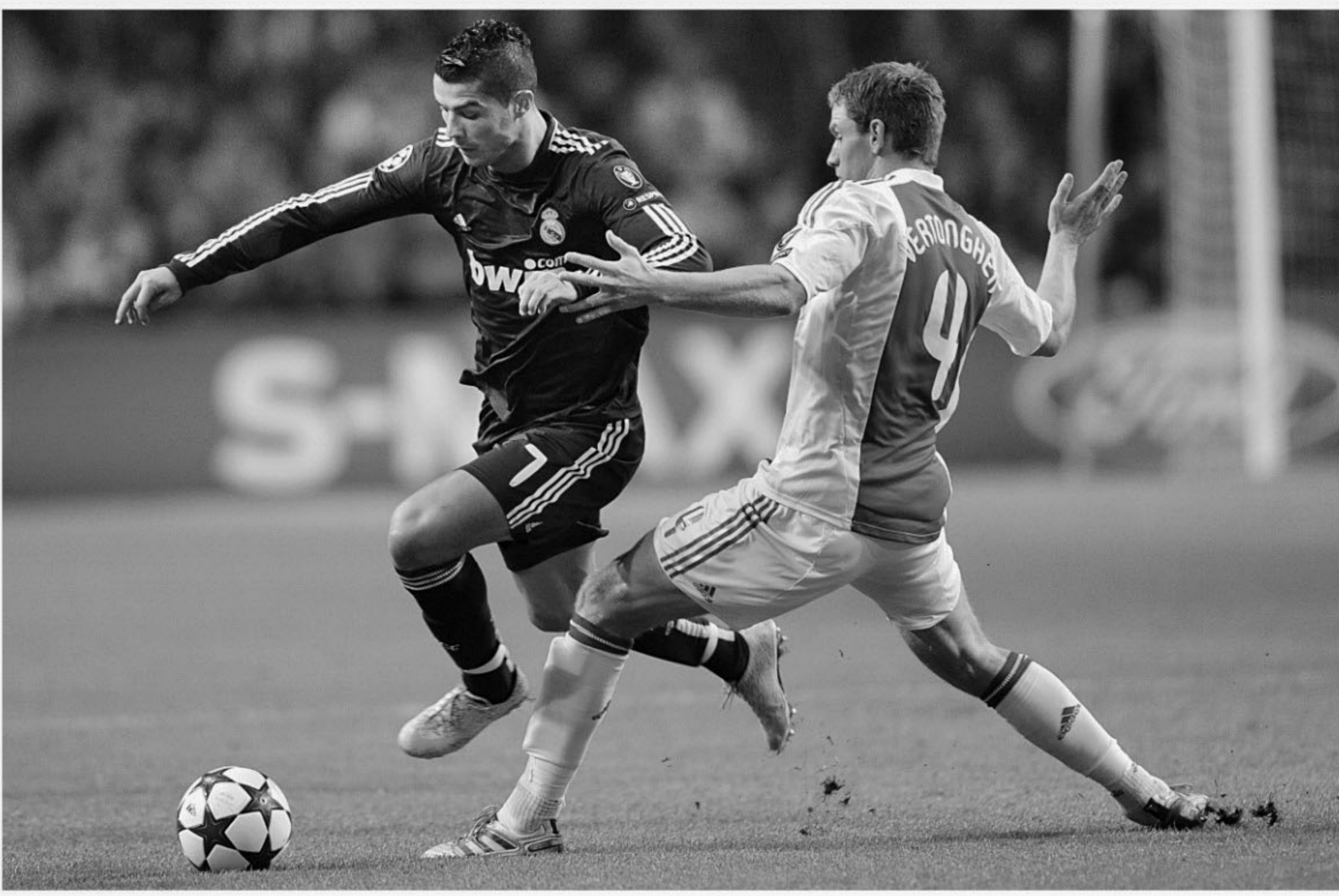
Real Madrid superstar Cristiano Ronaldo (L) dashes past Ajax Amsterdam defender Jan Vertonghen during their Champions League encounter in Amsterdam on Tuesday.

Benzema - who showed his class with a goal against England in the friendly victory last week - shot home from just inside the area after Mesut Ozil had deftly knocked back with his heel Alonso's perceptive long pass. Ajax had little bit in attack as Suarez was swamped whenever he got a sniff of the ball and it was no surprise when the visitors struck again shortly before half-time. Ronaldo's freekick rebounded off the wall but Arbeloa had no hesitation in trying his luck from way outside the area and his swerving effort left hosts' keeper Maarten Stekelenburg rooted to his line. Ronaldo should have made it 3-0 in the 47th minute as Benzema found him and he twisted free of his marker to be one on one with Stekelenburg but the Dutch 'keeper somehow managed to get down and deflect the shot over the bar leaving the Portuguese superstar shaking his head in disbelief. He was not to be denied in the 70th minute, though, as set up by Argentinian substitute Angel di Maria he made no mistake as he shot past Stekelenburg and 10 minutes later he converted a penalty.