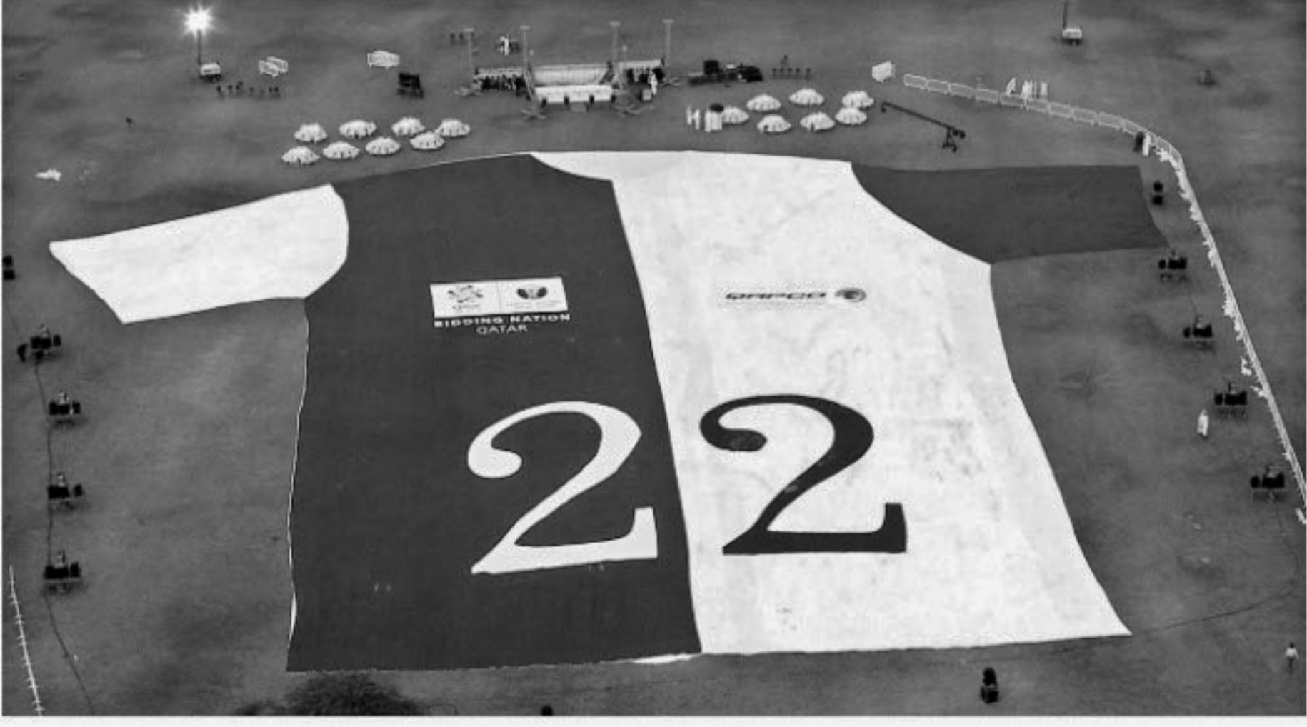
An aerial shot of the largest jersey in the world created by Qatar Petrochemical company in support of Qatar's 2022 World Cup bid in Doha yesterday.