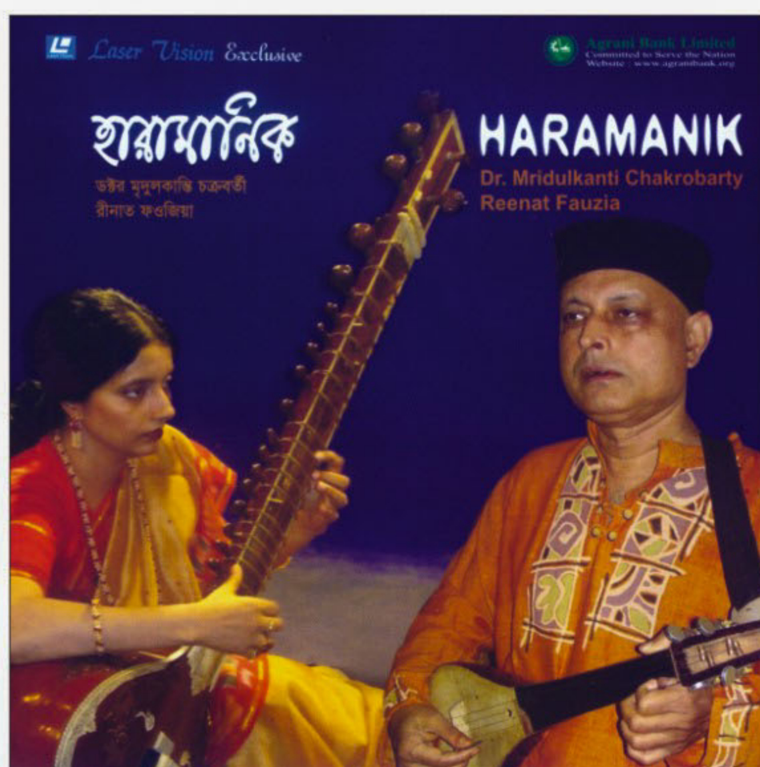
Cover of the album.