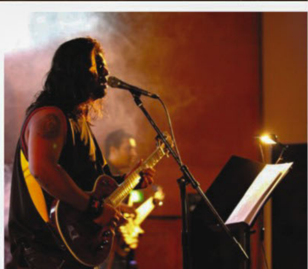
Clockwise (from top): Warfaze, Artcell and Nagarbaul will perform at the concert.

Taking a stand against gender violence, Bangladesh Musical Bands' Association (BAMBA), in association with UNFPA and the Government of Bangladesh, will hold a mega concert at the Army Stadium in Dhaka. Featuring popular bands of the country, the concert will be held tomorrow, says a press release.