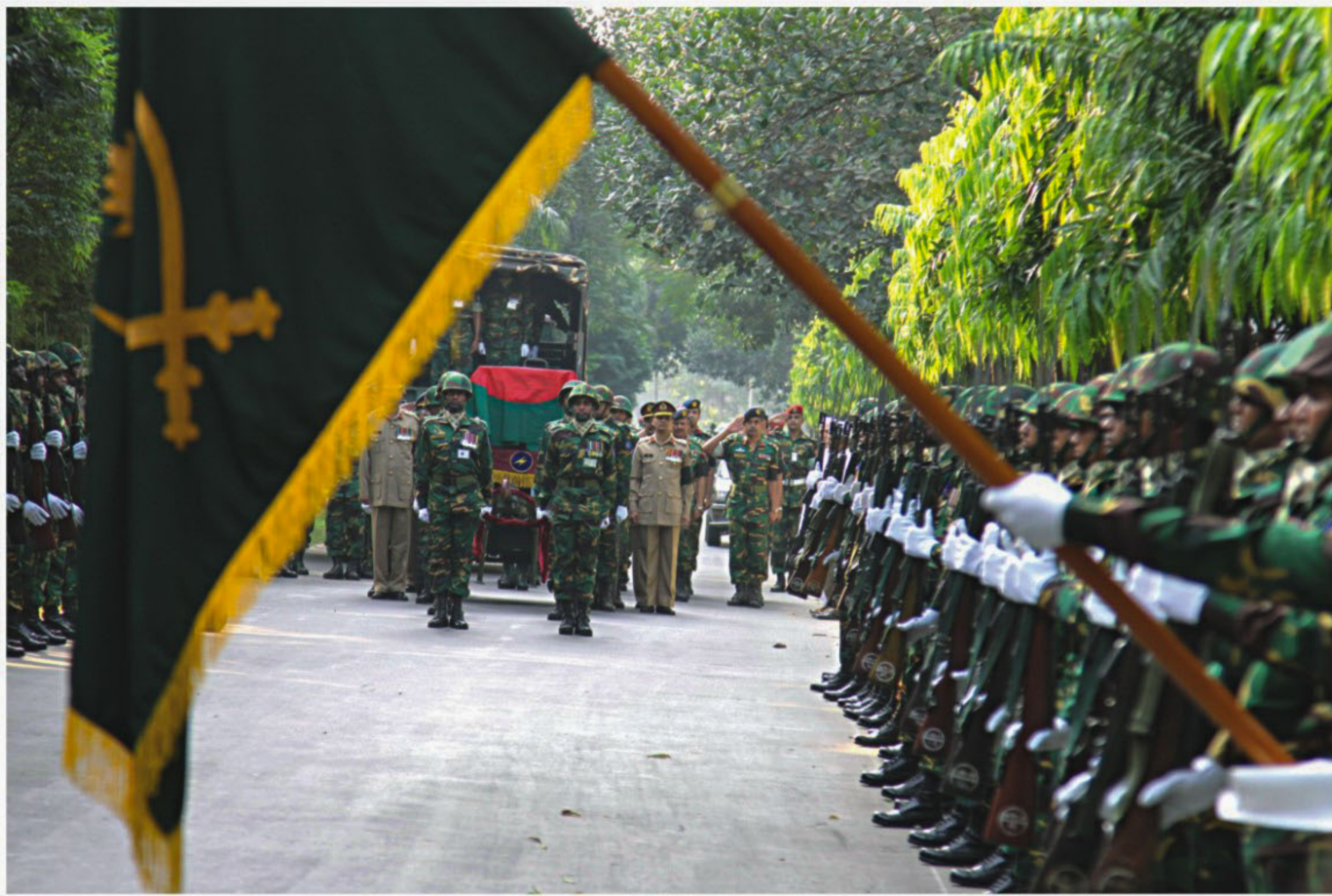
Flag-draped coffin of Mir Shawkat Ali is carried to Banani military graveyard for his burial yesterday afternoon. War veteran Mir Shawkat died on Saturday at the age of 74.