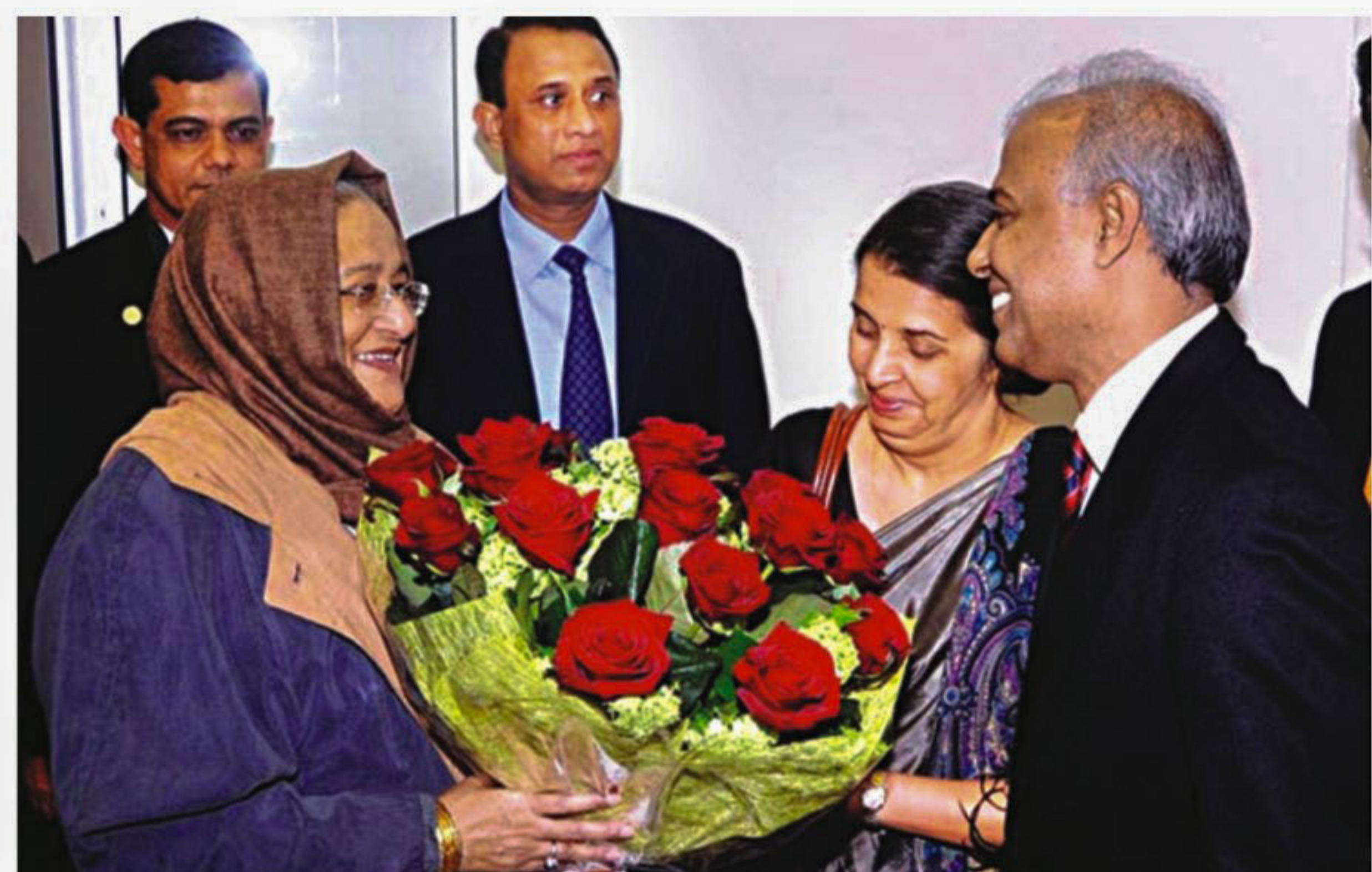
Prime Minister Sheikh Hasina being greeted by Bangladesh Ambassador to Russia SM Saiful as she reaches Saint Petersburg Airport yesterday. Story on page 1.