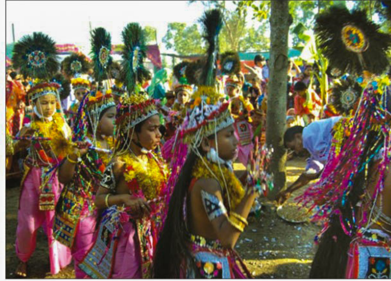
Manipuri boys perform the 'Goshtha Leela' dance.

In addition, a village fair at the Manipuri temple premises attracted many visitors. Vendors from different areas had come with their products, mainly handicraft items and toys.