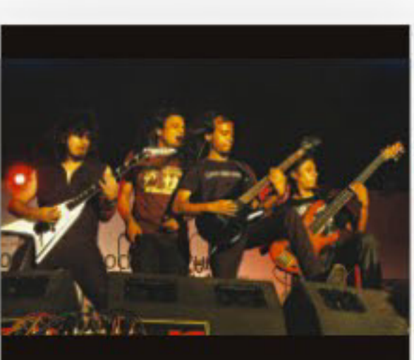
Music Craze: Warfaze On Banglavisian at 03:05pm Musical Show