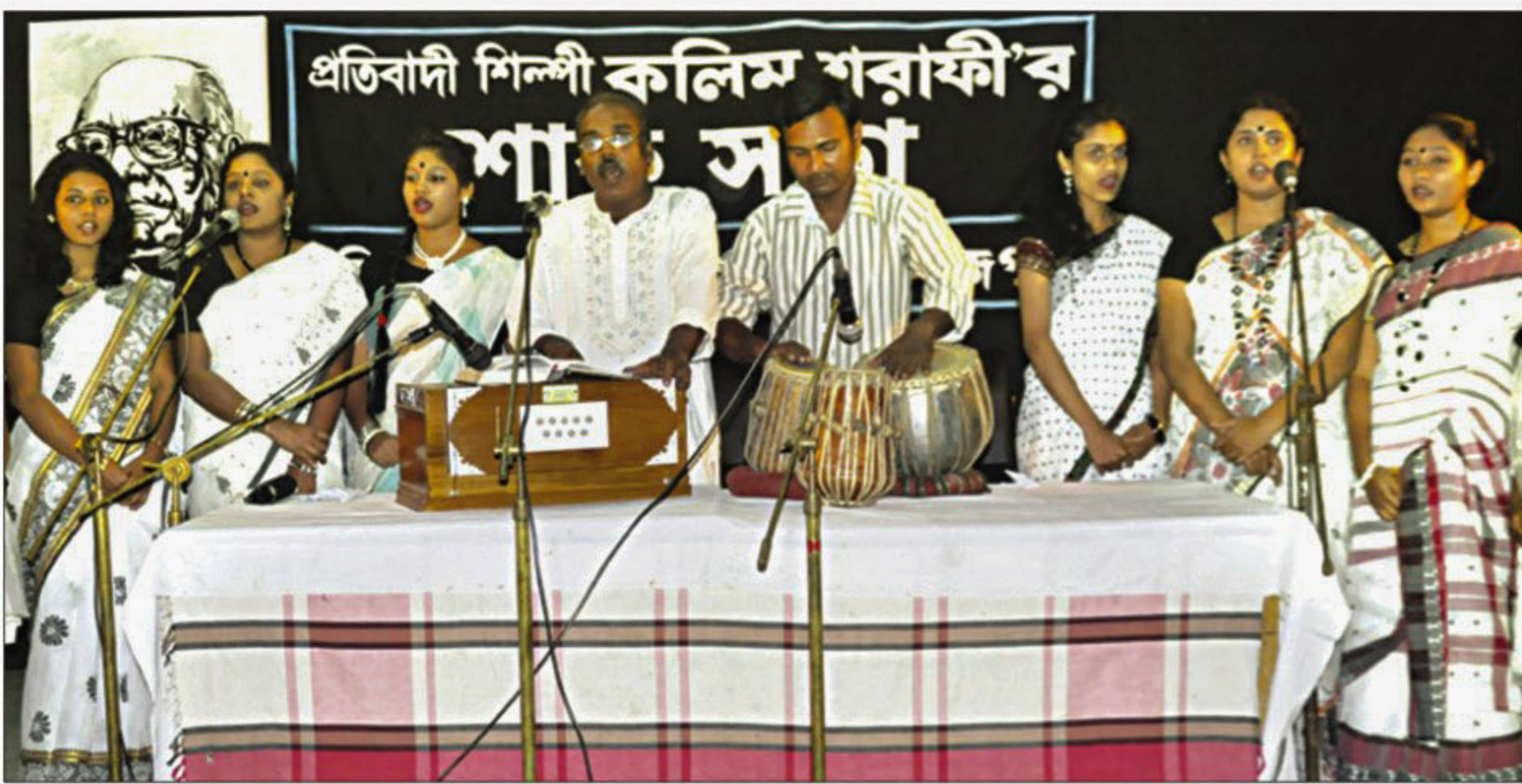
A chorus at the programme.