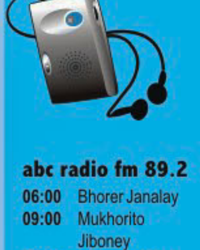
RADIO FOORTI 07:30 Hello Dhaka 10:00 Morning Express 12:00 My Time 01:00 No Tension 04:00 Dhaka Calling 09:00 Night Rider 01:00 Back to Back music abc radio fm 89.2 06:00 Bhoror Janalay 09:00 Mukhorito Jiboney 12:00 Darun Dupurey 03:00 Duranto Bikeley 05:00 Shondhatara 07:00 Shajer Maya 09:00 Raat-er Akashay 11:00 Golper Shesh Nel RADIO TODAY 07:15 Good Morning Dhaka 11:00 Musti Unlimited 01:00 Today's Adda 04:00 U Turn 08:00 Tobey Tai Hok 11:00 Raat Bhor-Gaan 12:00 Today's Happy Moments