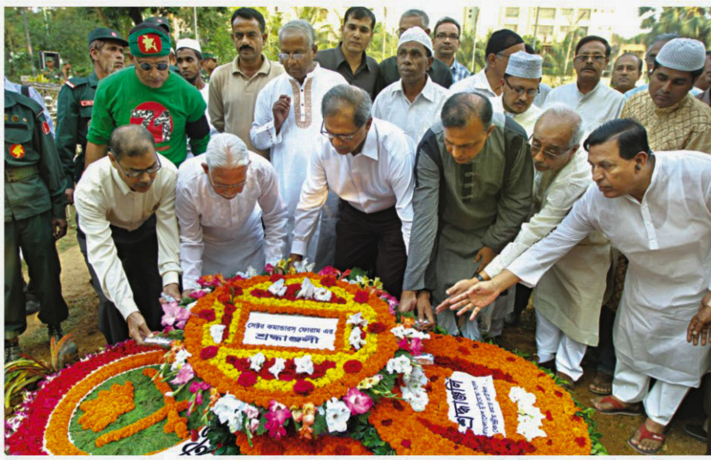
Sector Commanders Forum places wreath at the grave of Mir Shawkat Ali at the Cantonment Graveyard of Banani in the city yesterday. (Story on Page 16)

As many as 74 people including 57 army officers were killed during the carnage on February 25-26 last year in the Palkhana headquarters.