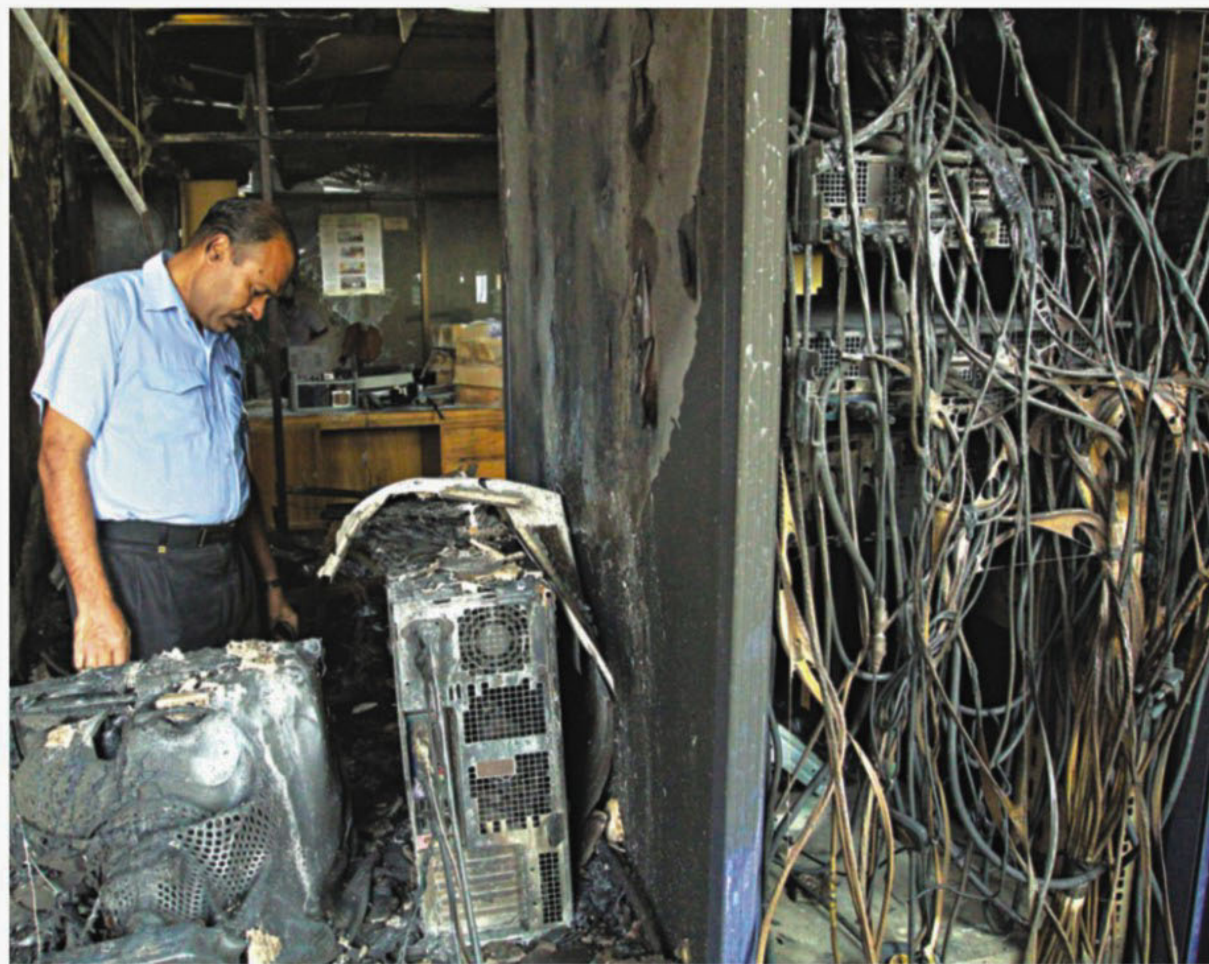
A fire last night completely burned the main server of Investment Corporation of Bangladesh at its head office in the city yesterday.

He said Bangladesh Forest Department and Wildlife Trust of Bangladesh are jointly working to reduce the tiger-human conflict in the villages around the Sundarbans, a habitat of Royal Bengal Tiger.