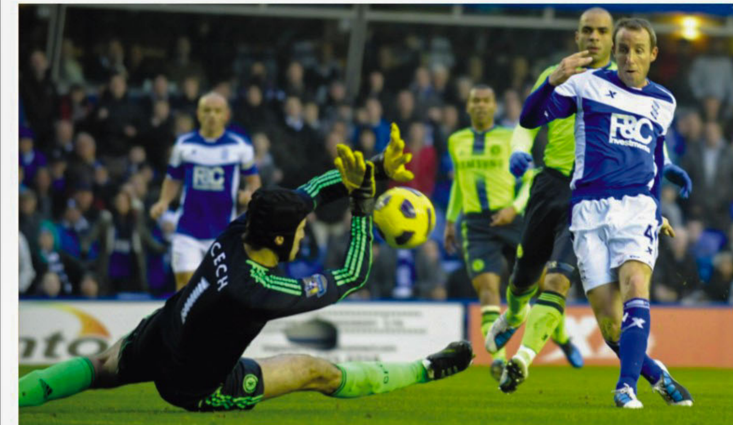
Birmingham midfielder Lee Bowyer (R) scores the only goal of the game past Chelsea goalkeeper Peter Cech (L) during their Premier League clash at St Andrews on Saturday.

Menez scored a superb solo goal in the 24th minute before setting up Marco Borriello for Roma's second in the 56th minute to wrap up the points for the capital club.