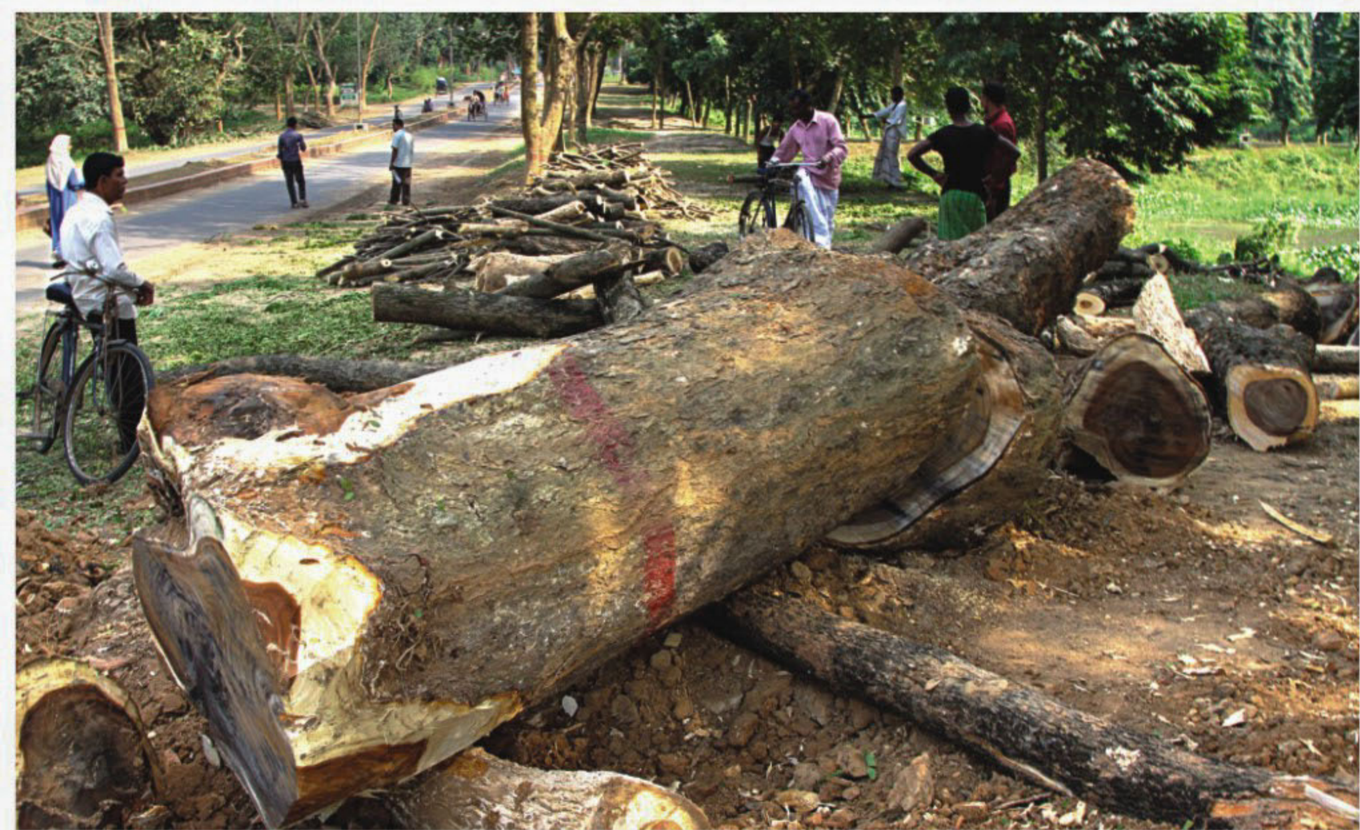
Trees at the central reservation of the road between Dairy Gate and the Shaheed Minar in Jahangirnagar University are being chopped down to make way for flower bushes.