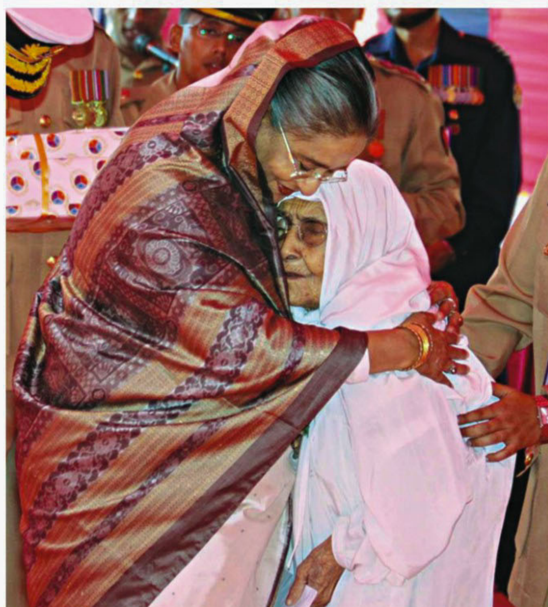
Prime Minister Sheikh Hasina hugs the 99-year-old mother of Birshreshtha Munshi Abdur Rouf at a reception organised to mark the Armed Forces Day-2010 yesterday at the Senakunja.

STAFF CORRESPONDENT Primary Education Terminal Examination, 2010 of both general and madrasa students will begin tomorrow with around 25 lakh participants. The largest public examination in terms of number of examinees will start at 11:00am at 5,993 centres across the country and SEE PAGE 15 COL 7