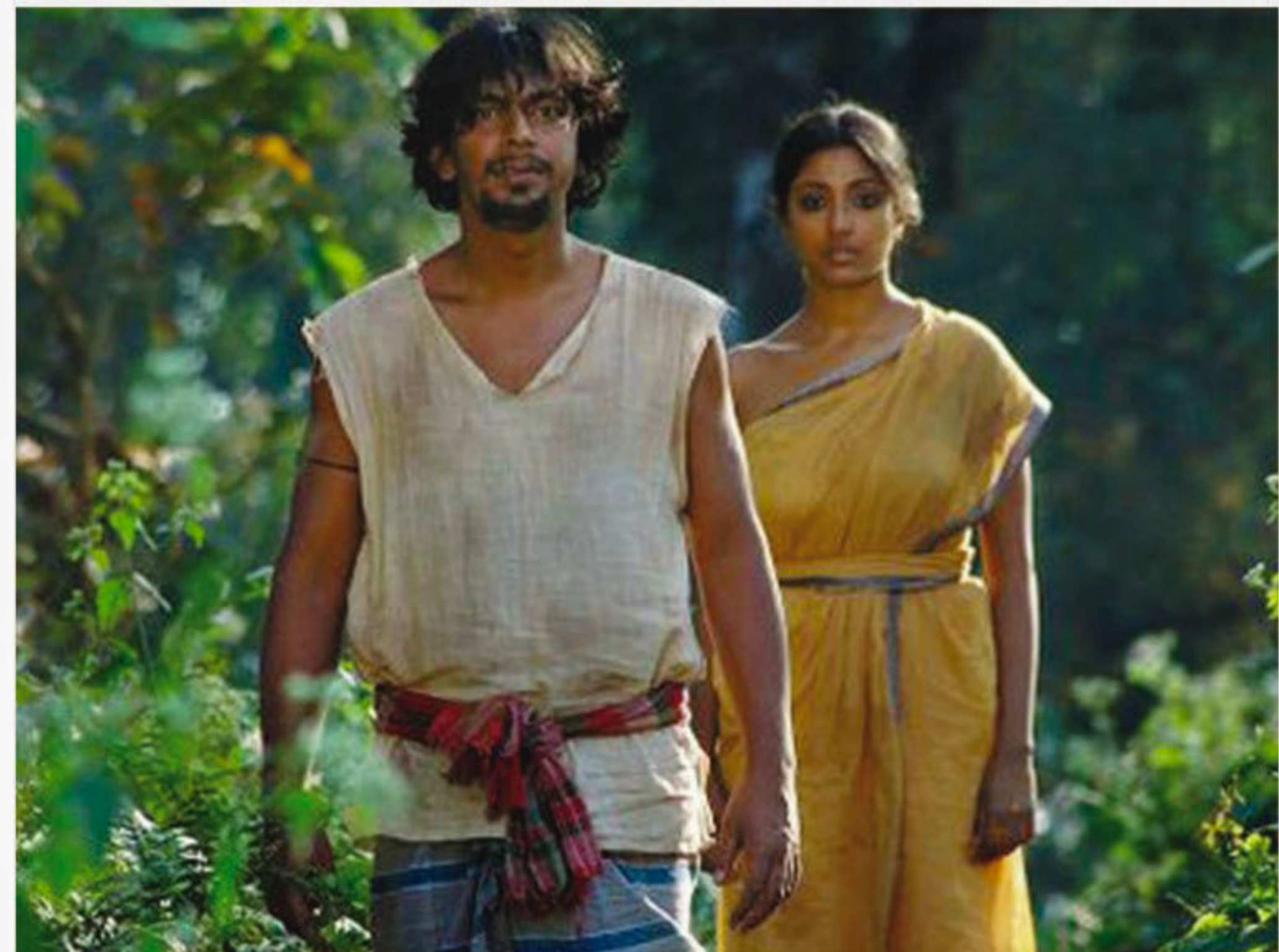
The film, shot in Bangladesh and India, has a mixed cast.

The IFFI also announced a five-member international jury which will be headed by Polish writer-