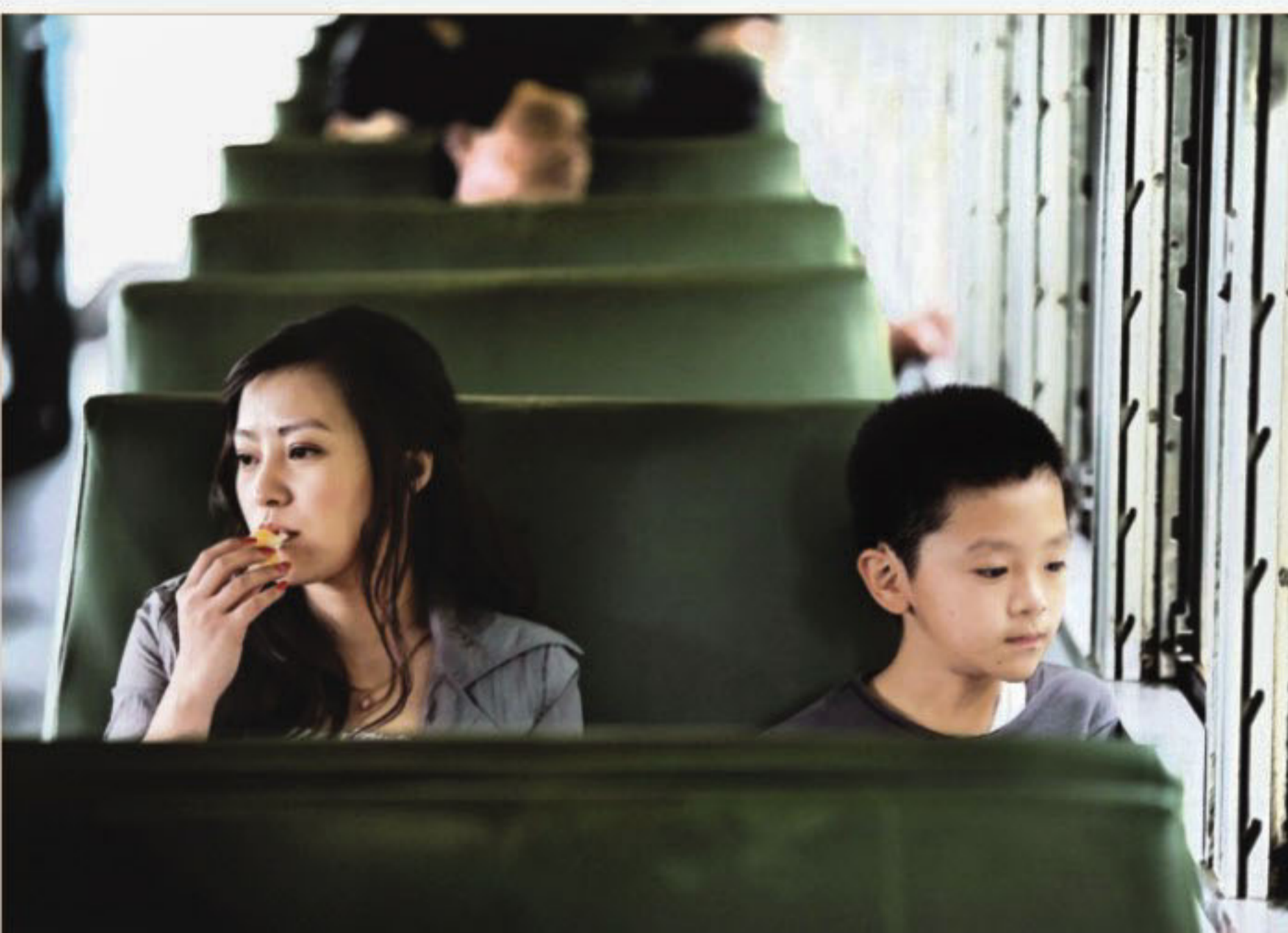
A scene from the film "The Fourth Portrait".