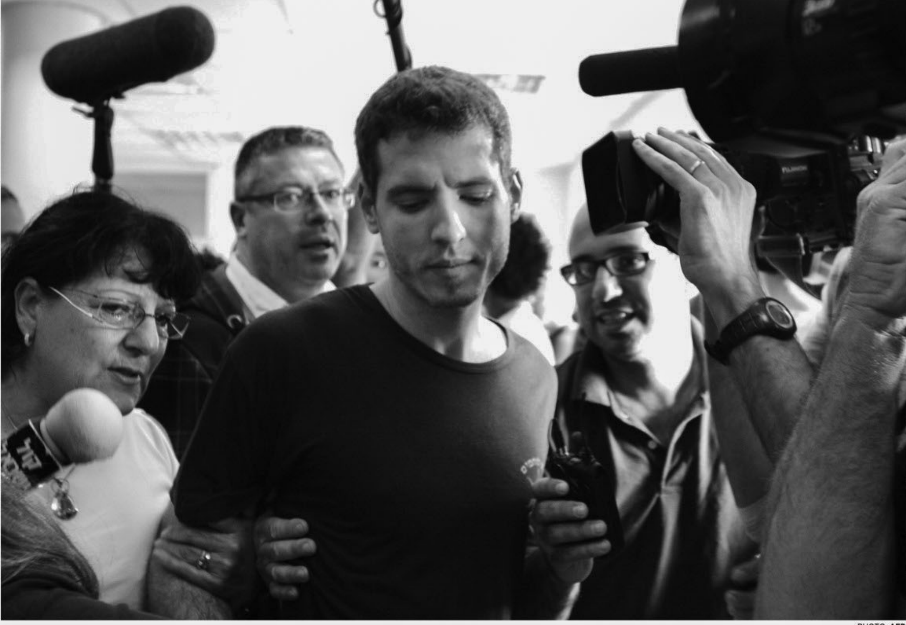
One of two Israeli soldiers from the Givati Brigade (C) is seen leaving a military court in Castina, close to the city of Kiryat Malachi yesterday, after being given suspended sentences of three months imprisonment and demoted for using a Palestinian a nine-year-old boy as a human shield by making him check for bombs during the 2008-2009 Gaza war, army radio said.