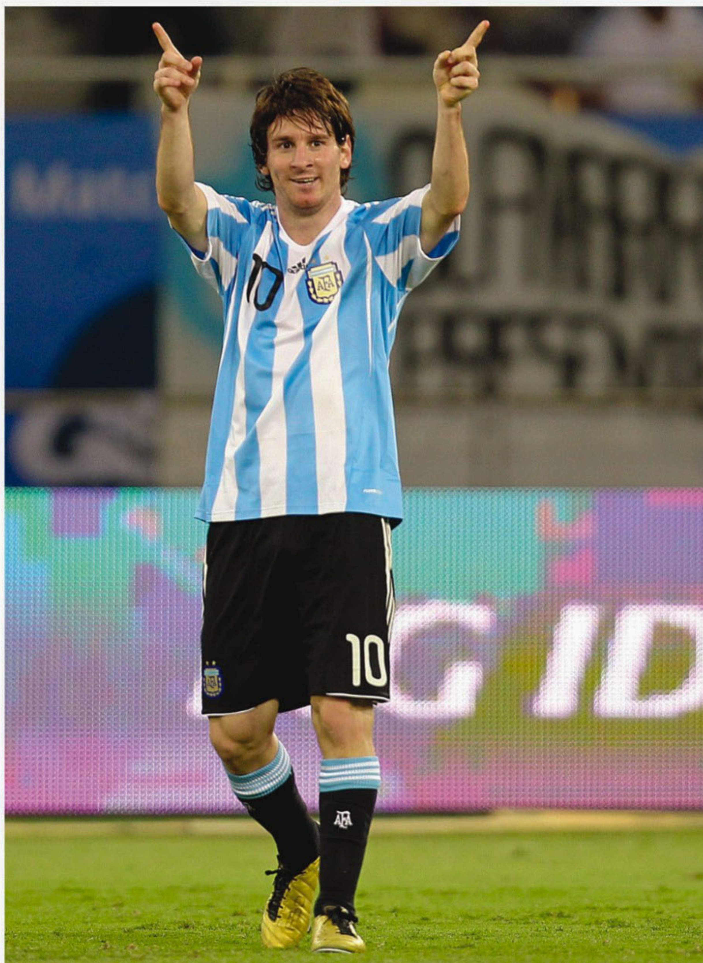
Argentina superstar Lionel Messi celebrates his all-important goal against Brazil during their international friendly at the Khalifa Stadium in Doha on Wednesday.

Brazil were then aggrieved when the referee played advantage after Neymar was chopped down on the edge of the Argentina box, as Robinho had strayed into an offside position and the flag went up when the ball came to him.