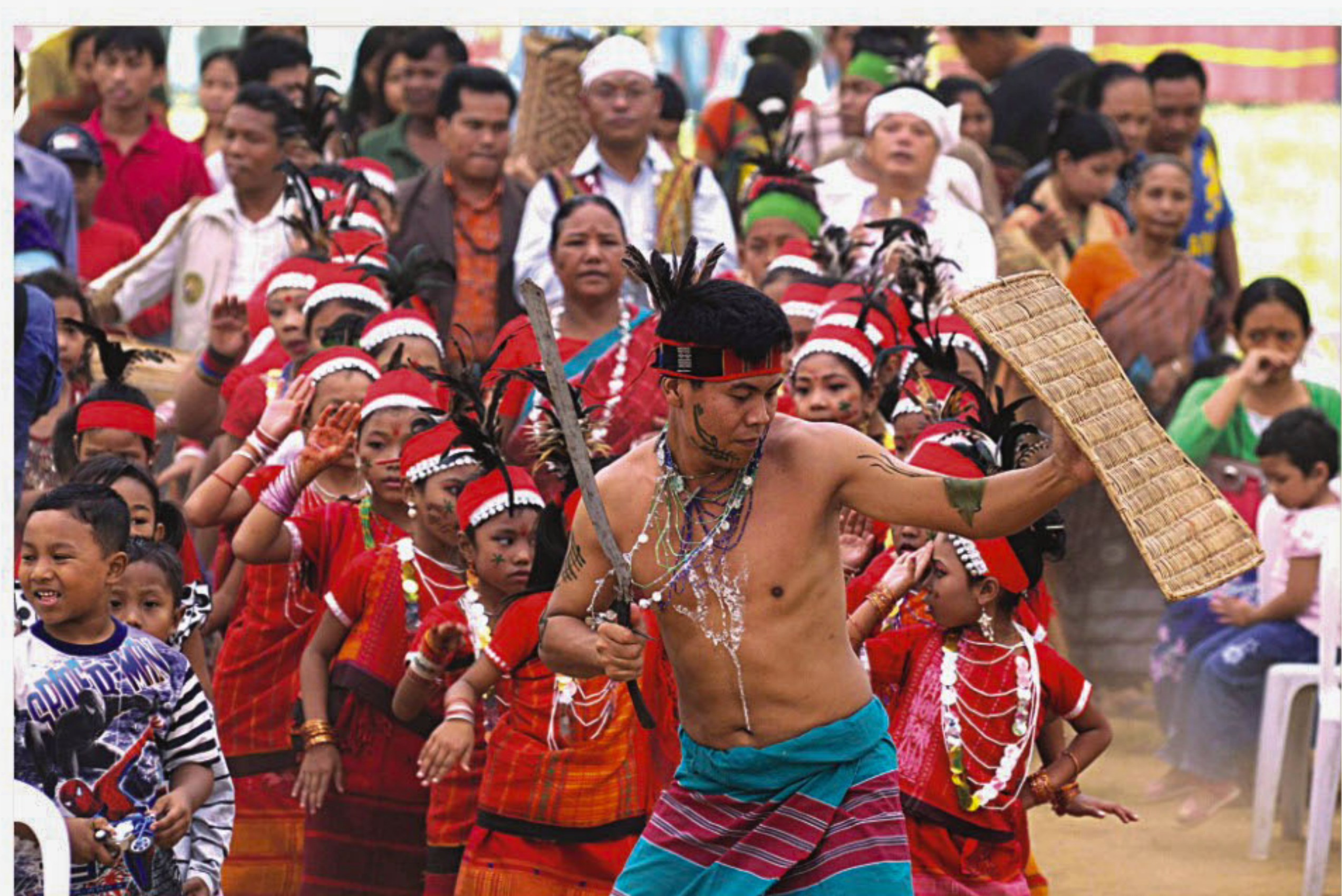
Garo children sing and dance at Bidya Niketon High School at the capital's Banani celebrating Wangala, a thanksgiving to their god Misi Saljong, yesterday. The Garos believe fruits and roots collected from jungles were their food thousands of years ago and they did not have seeds to grow food. One day they prayed to their god and the next day they were given two types of rice seeds. They preserved them and started cultivating on the hills. After the harvest they thanked their god and celebrated the occasion before consuming the rice. Story on page 3.