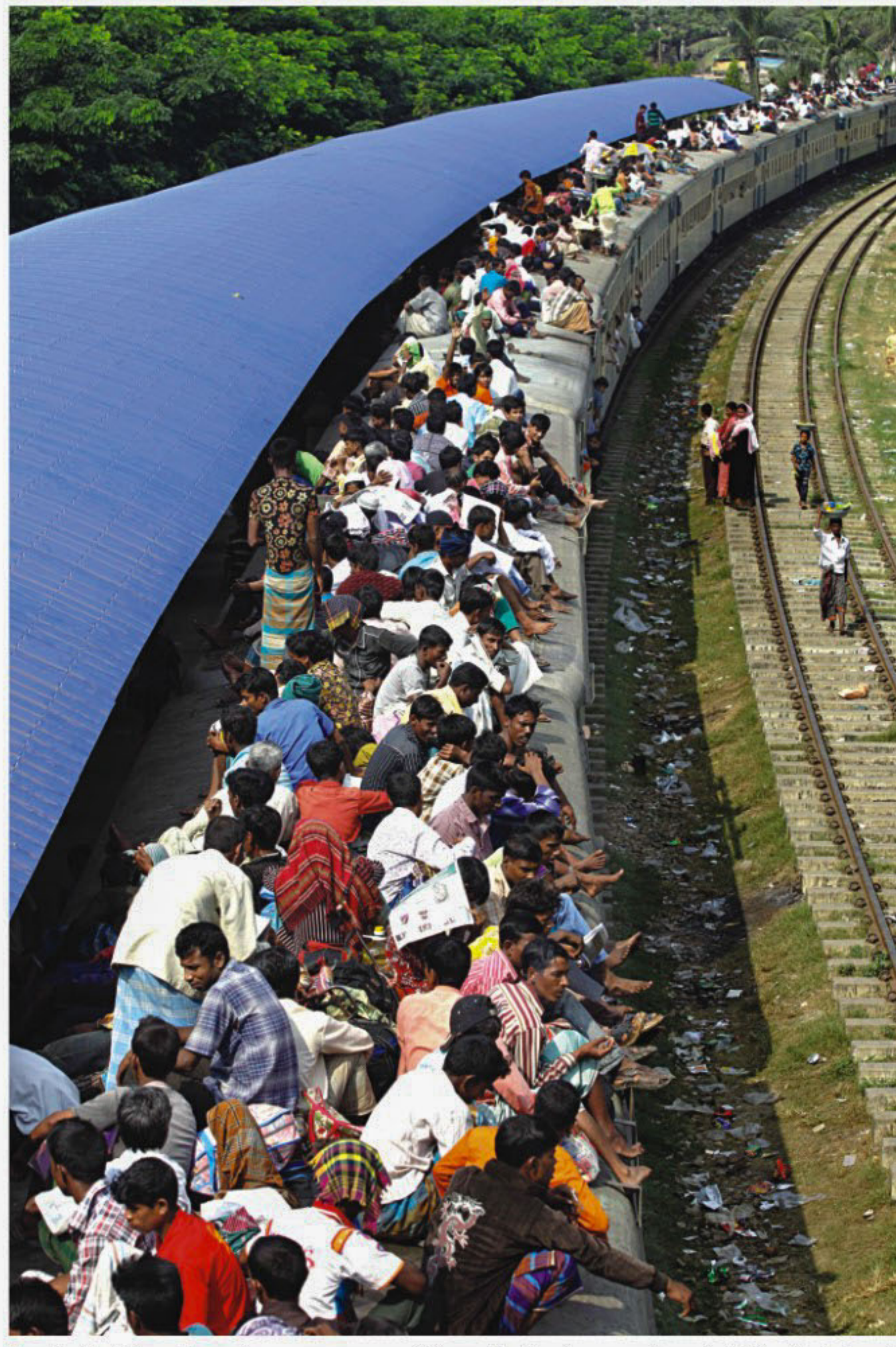
Hundreds of homebound passengers crowd the roofs of train compartments risking their lives to meet their kins and share the joy of Eid festivity. This picture was taken at the Airport Railway Station in the capital yesterday. Story on page 1.