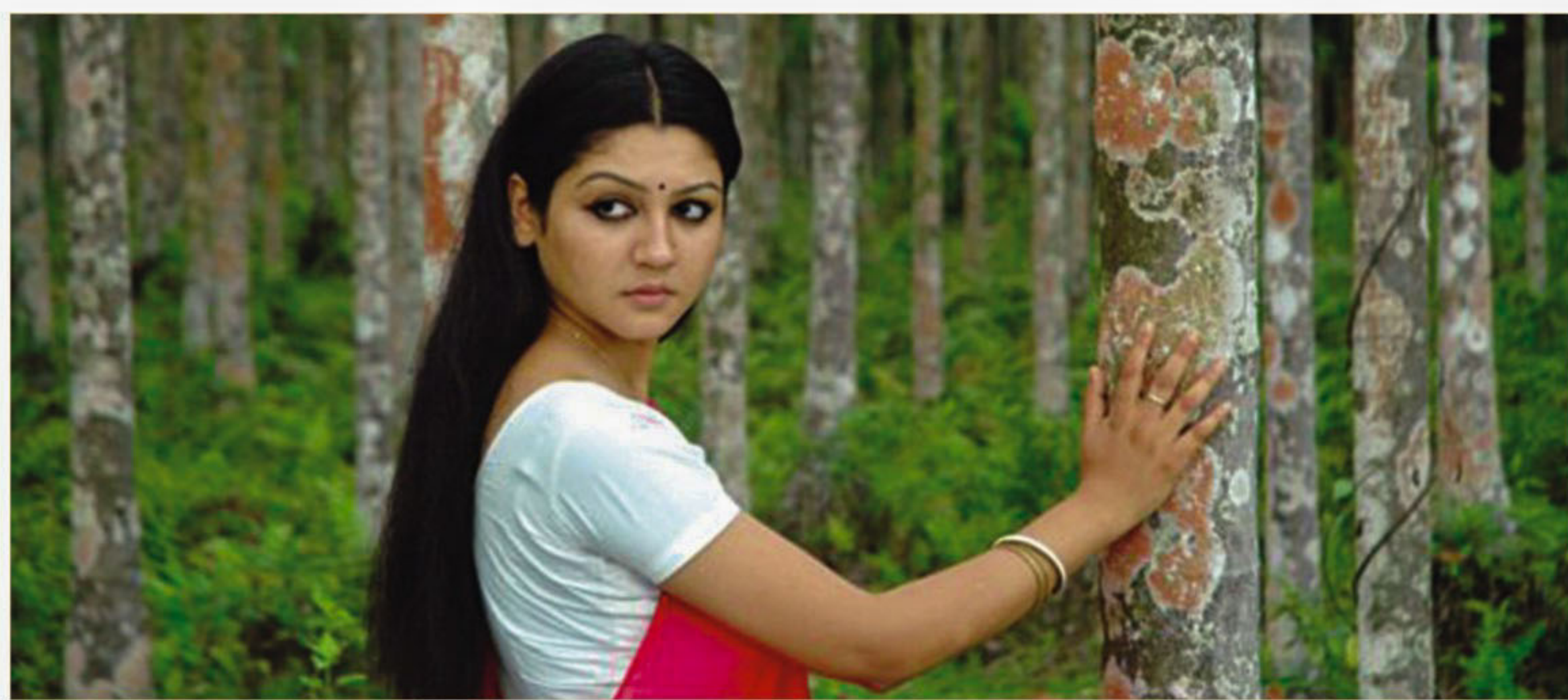
Joya Ahsan in a scene from the film.