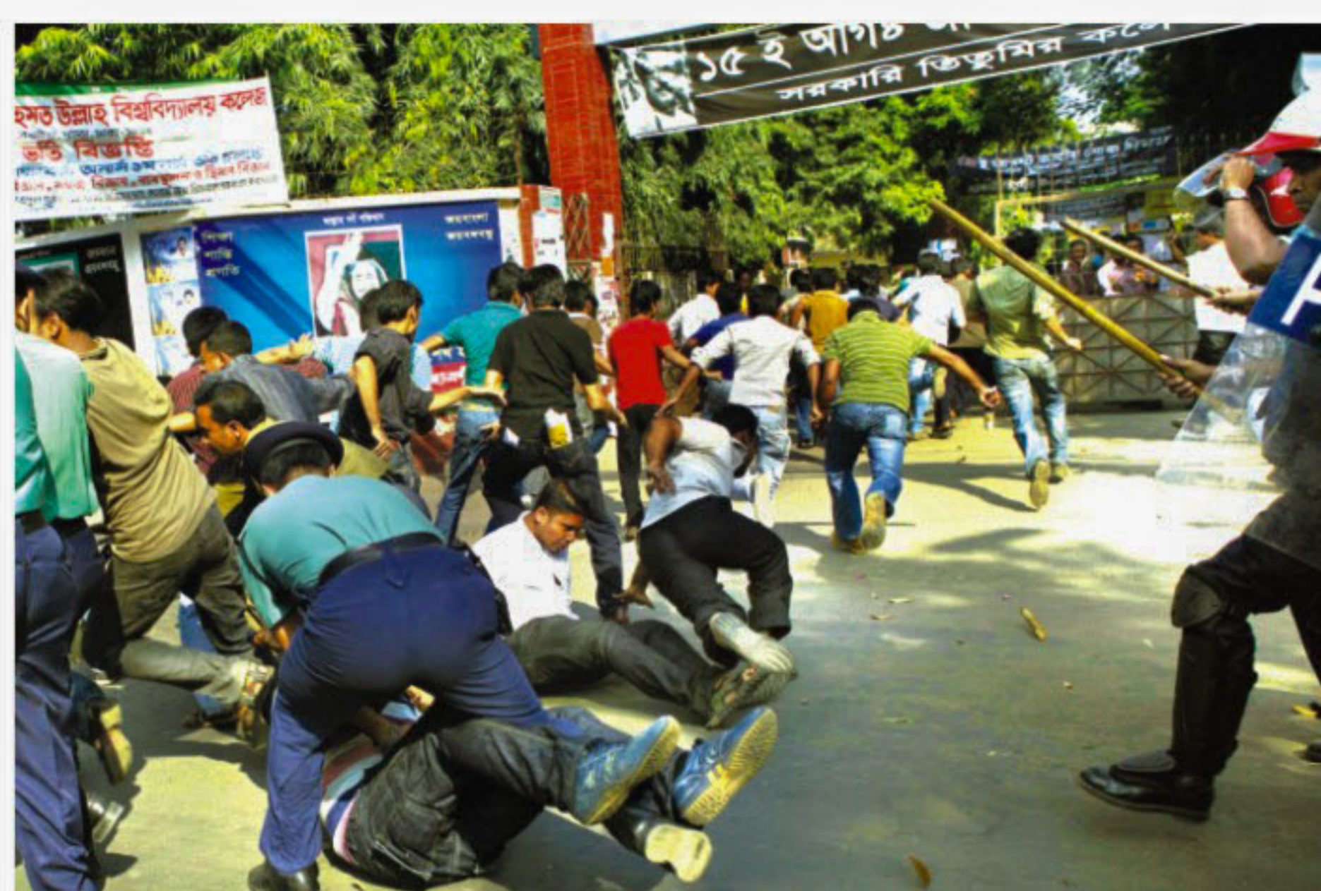
Police charge baton on hartal activists in front of Titumir College at Mohakhali in the city yesterday.

"We see comparatively less number of patients ahead of Eid every year," said officials at the hospitals, adding only the emergency patients visited the hospitals yesterday due to hartal.