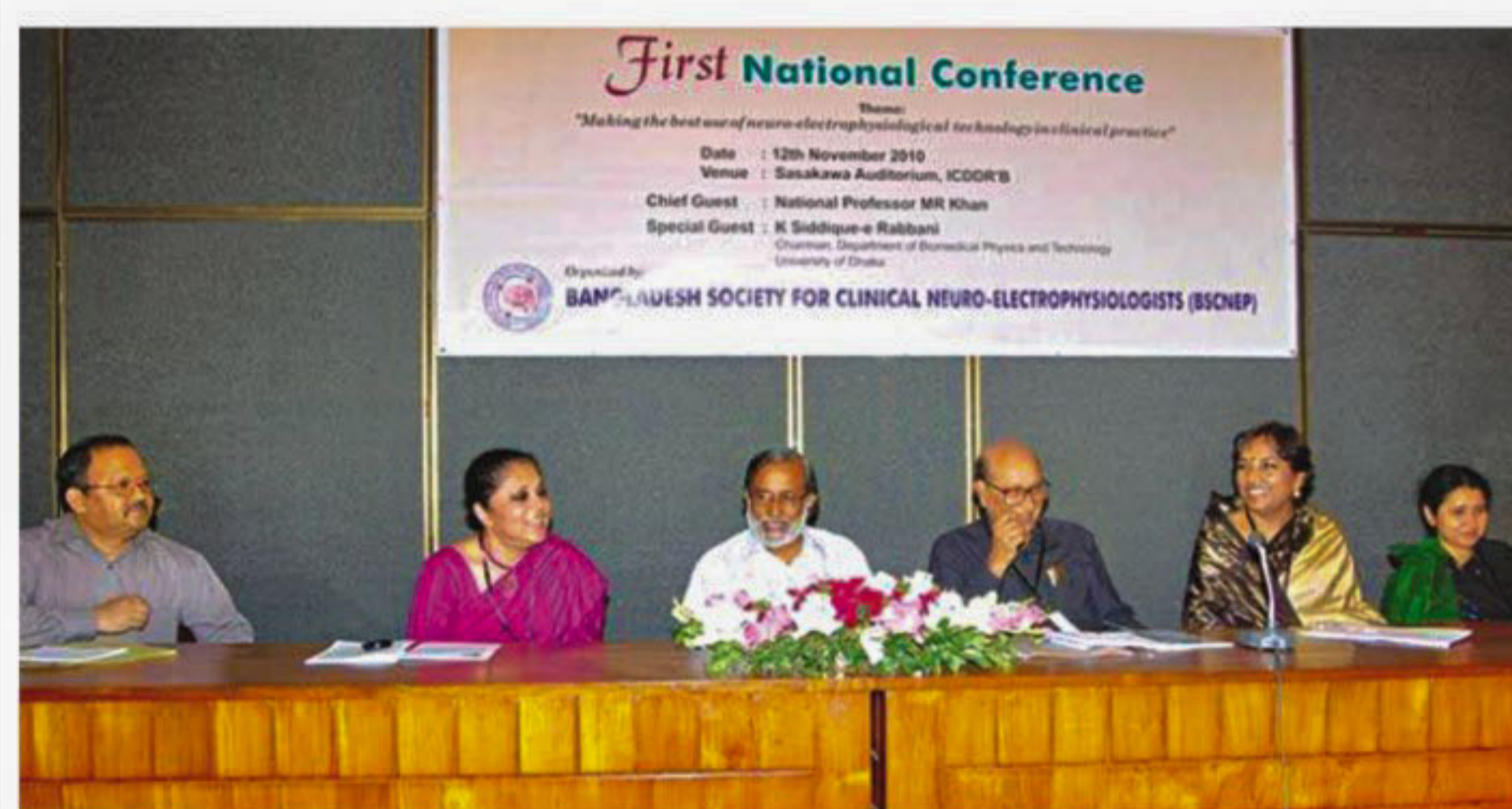
Participants at the inaugural session of the first national conference of the Bangladesh Society for Clinical Neuro-Electro-physiologists held at the Sasakawa Auditorium, ICDDR,B in the city on Friday.

According to ISPR, the week-long tour of the ship will strengthen relations between China and Bangladesh Navy.