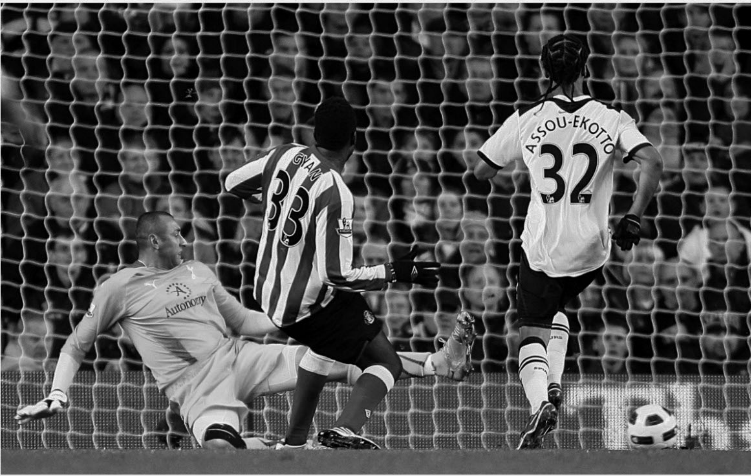
Sunderland striker Asamoah Gyan (C) scores the equalising goal against Tottenham Hotspurs during their Premier League encounter at White Hart Lane on Tuesday.