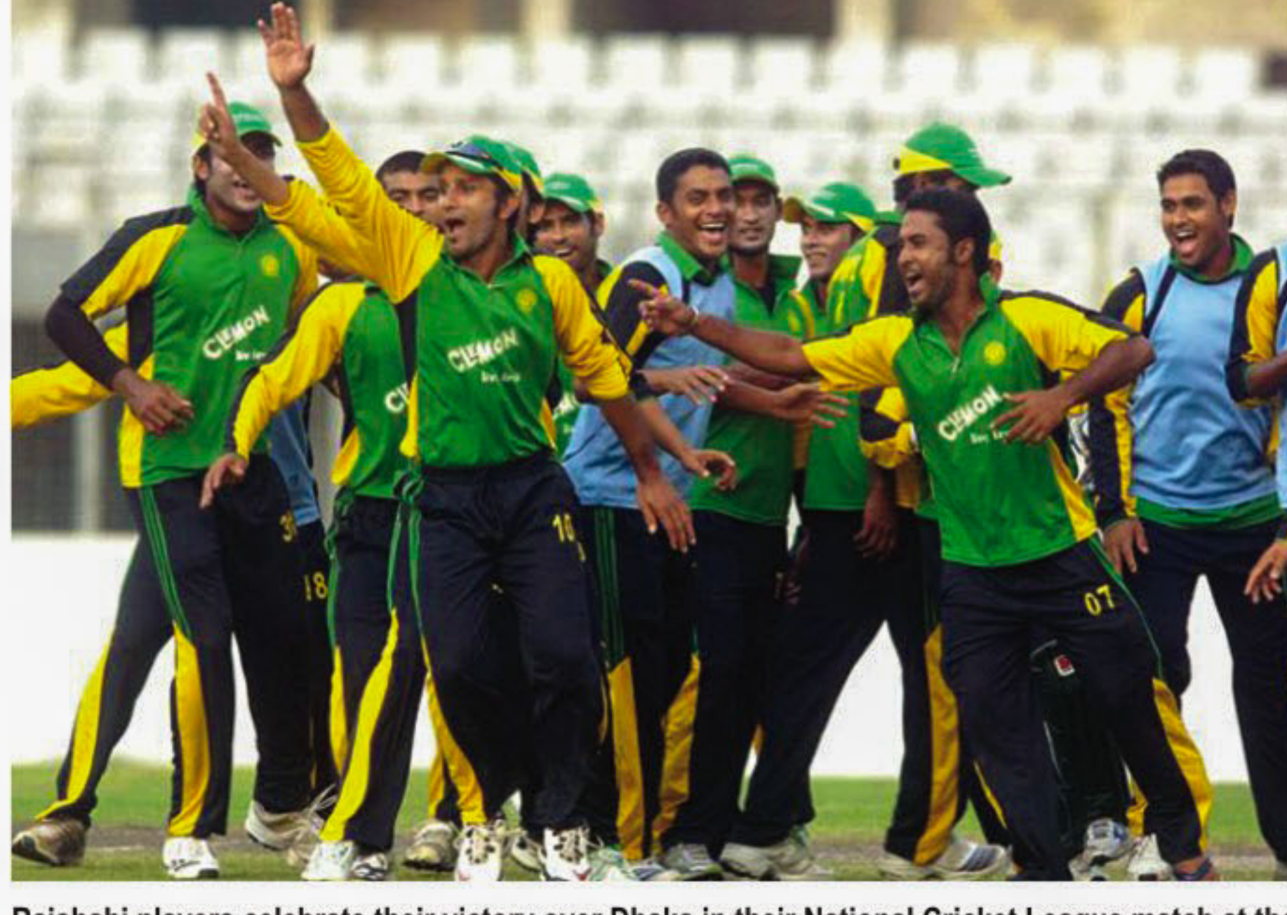
Rajshahi players celebrate their victory over Dhaka in their National Cricket League match at the Sher-e-Bangla National Stadium in Mirpur yesterday.