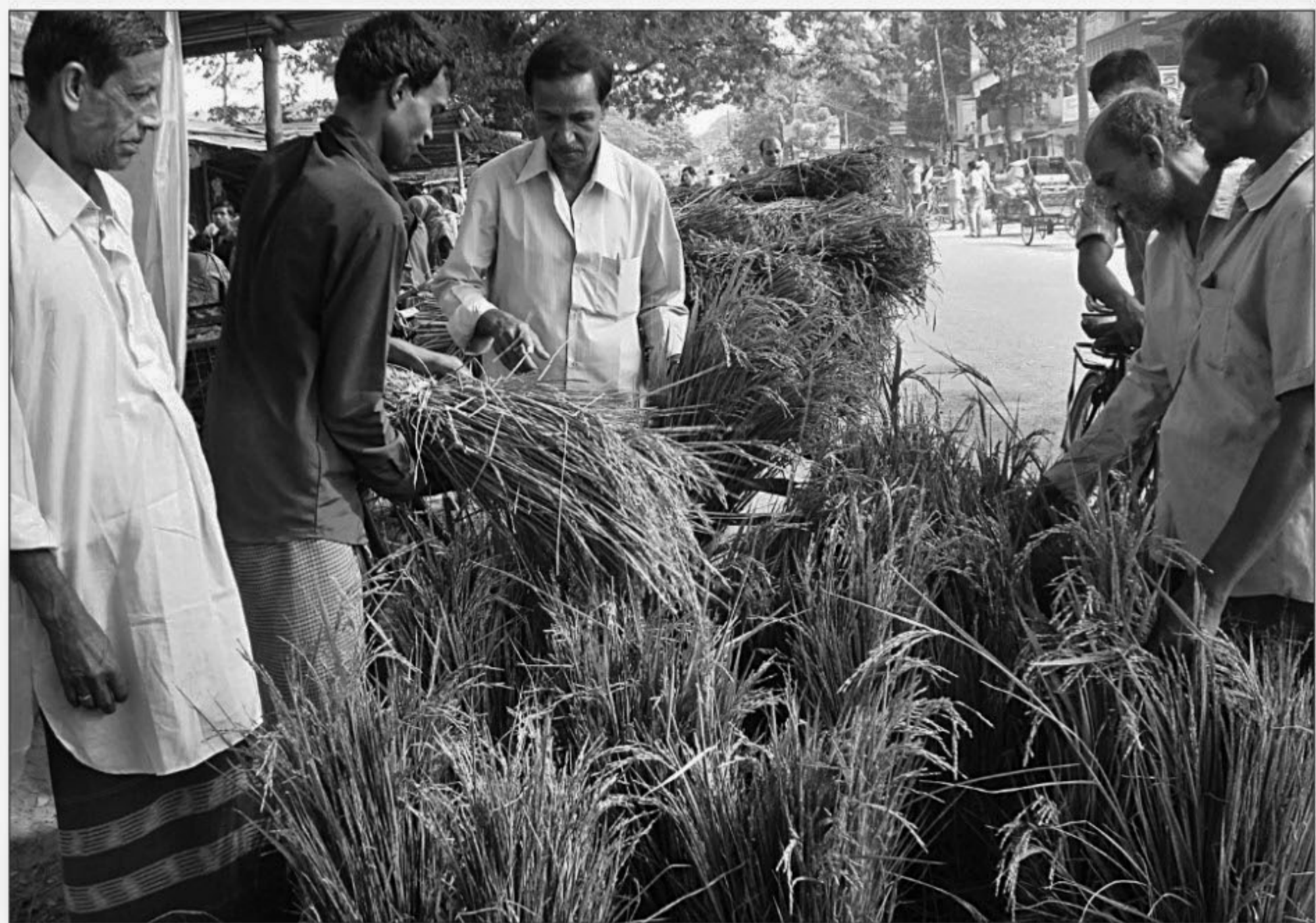
Farmers of Patbila village in Kaliganj upazia of Jhenidah district sell sterile paddy plants as fodder to recover whatever portion of the cultivation cost they can.

Born in 1941 MN Larma founded the Parbatya Chattagram Jana Sanghati Samiti (PCJSS) on February 15, 1972. In 1977 he organised the Shanti Bahini, an armed front operating in the Hill Tracts area. He was murdered by criminals on November 10, 1983.