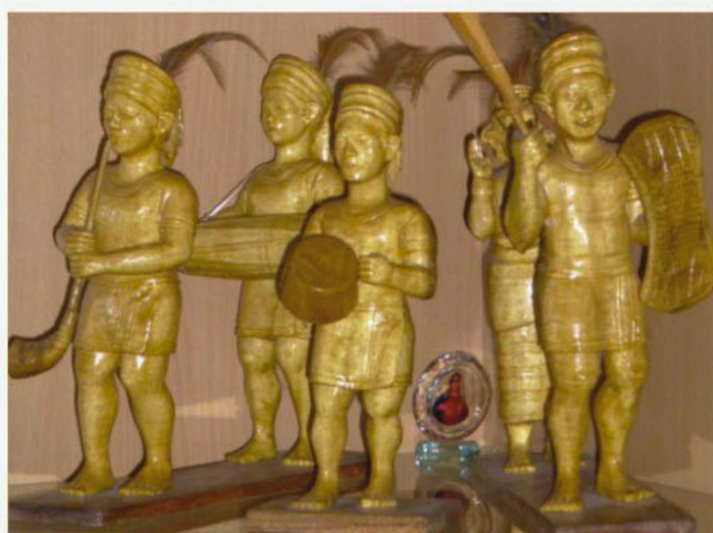
Traditional indigenous products on display.