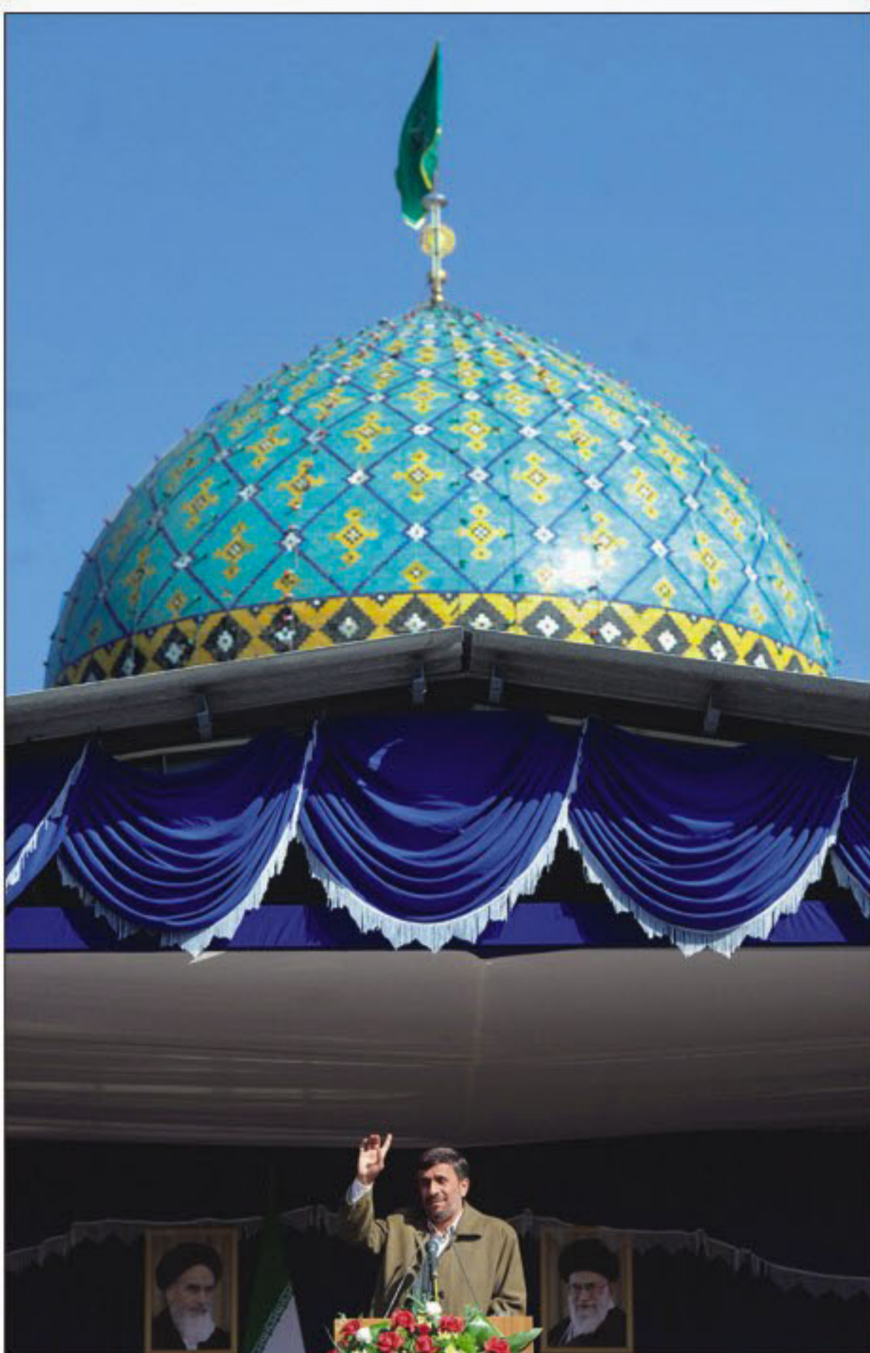
Iranian President Mahmoud Ahmadinejad delivers his speech during a public meeting in the northern city of Qazvin yesterday.