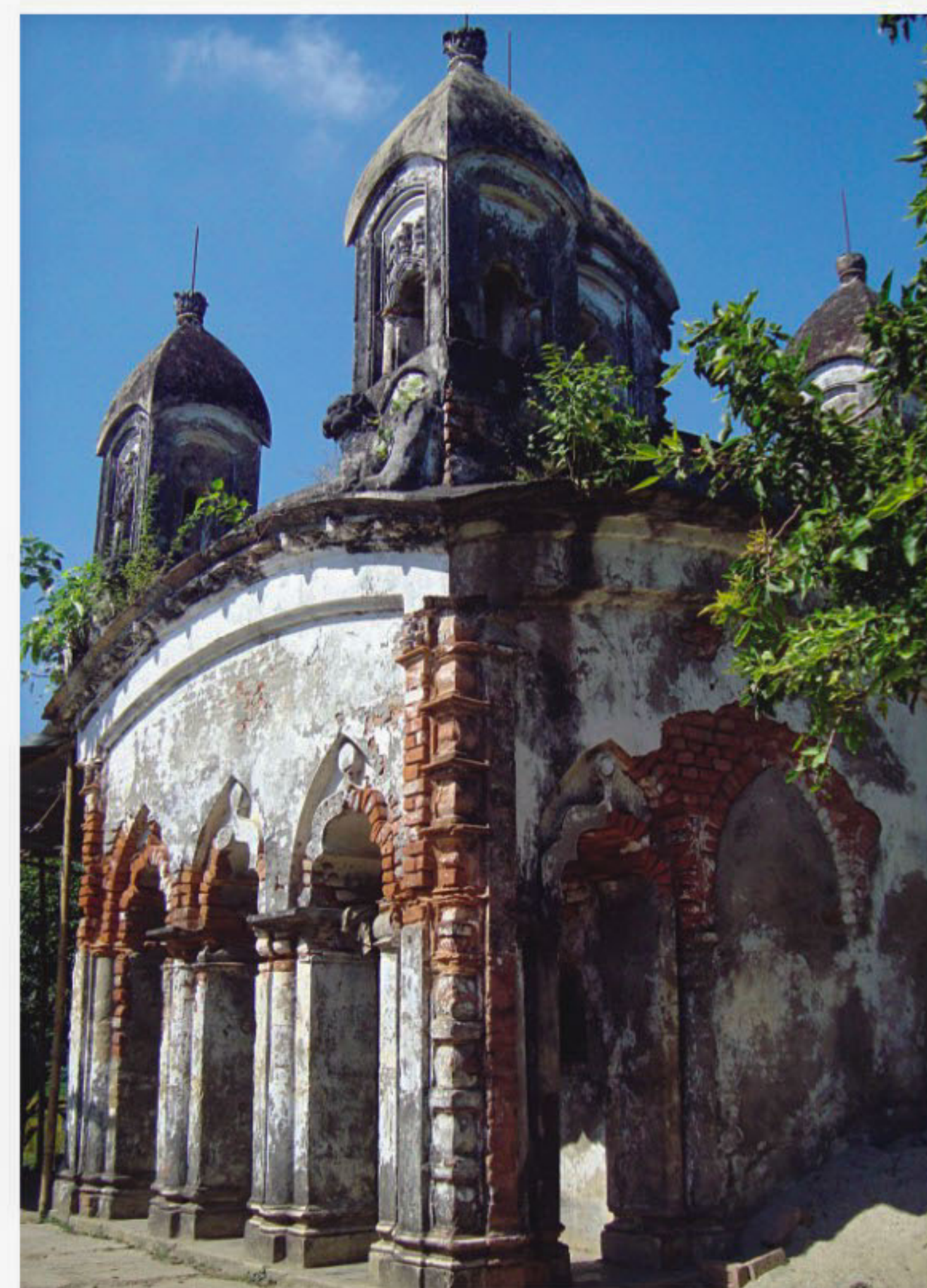
Grass and plants have sprouted on the temple's walls and roof, while cracks have developed around the structure.