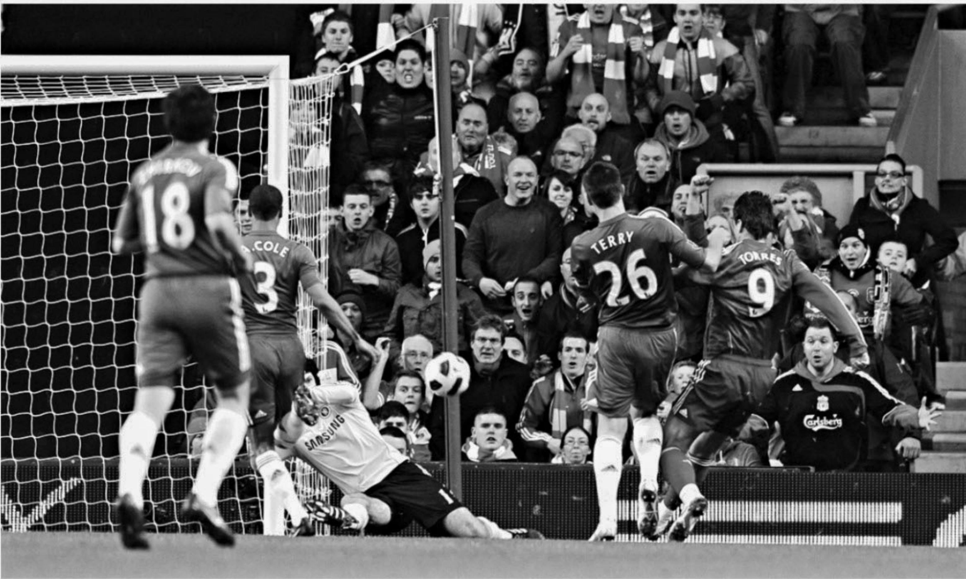
Liverpool striker Fernando Torres (R) scores the opening goal against Chelsea during their Premier League encounter at Anfield on Sunday.