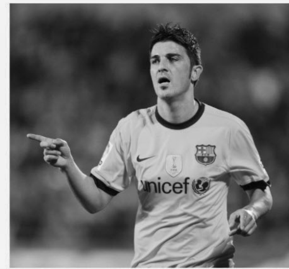
Barcelona forward David Villa celebrates his goal against Getafe during their Primera Liga clash at the Alfonso Perez Coliseum on Sunday.

The Magpies striker later made headlines for the right reasons when he gave Newcastle a shock 1-0 victory over Arsenal at the Emirates Stadium on Sunday.