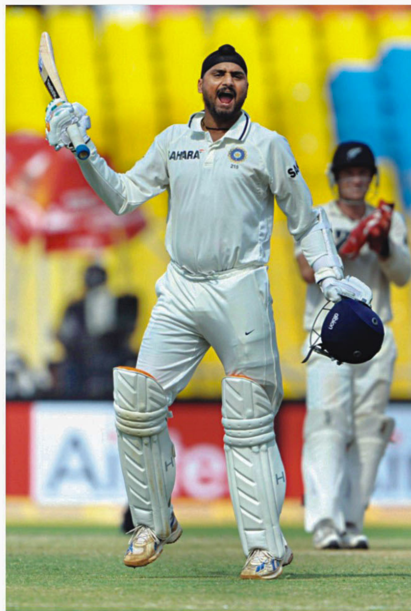
India's Harbhajan Singh celebrates after scoring his century on the fifth and final day of the first Test against New Zealand at the Sardar Patel Stadium in Ahmedabad yesterday.

PAKISTAN: Mohammad Hafeez, Shahzaib Hasan, Fawad Alam, Younis Khan, Shahid Afridi, Mohammad Yousuf, Abdul Razzaq, Umar Akmal, Wahab Riaz, Abdul Rehman, Shoaib Akhtar