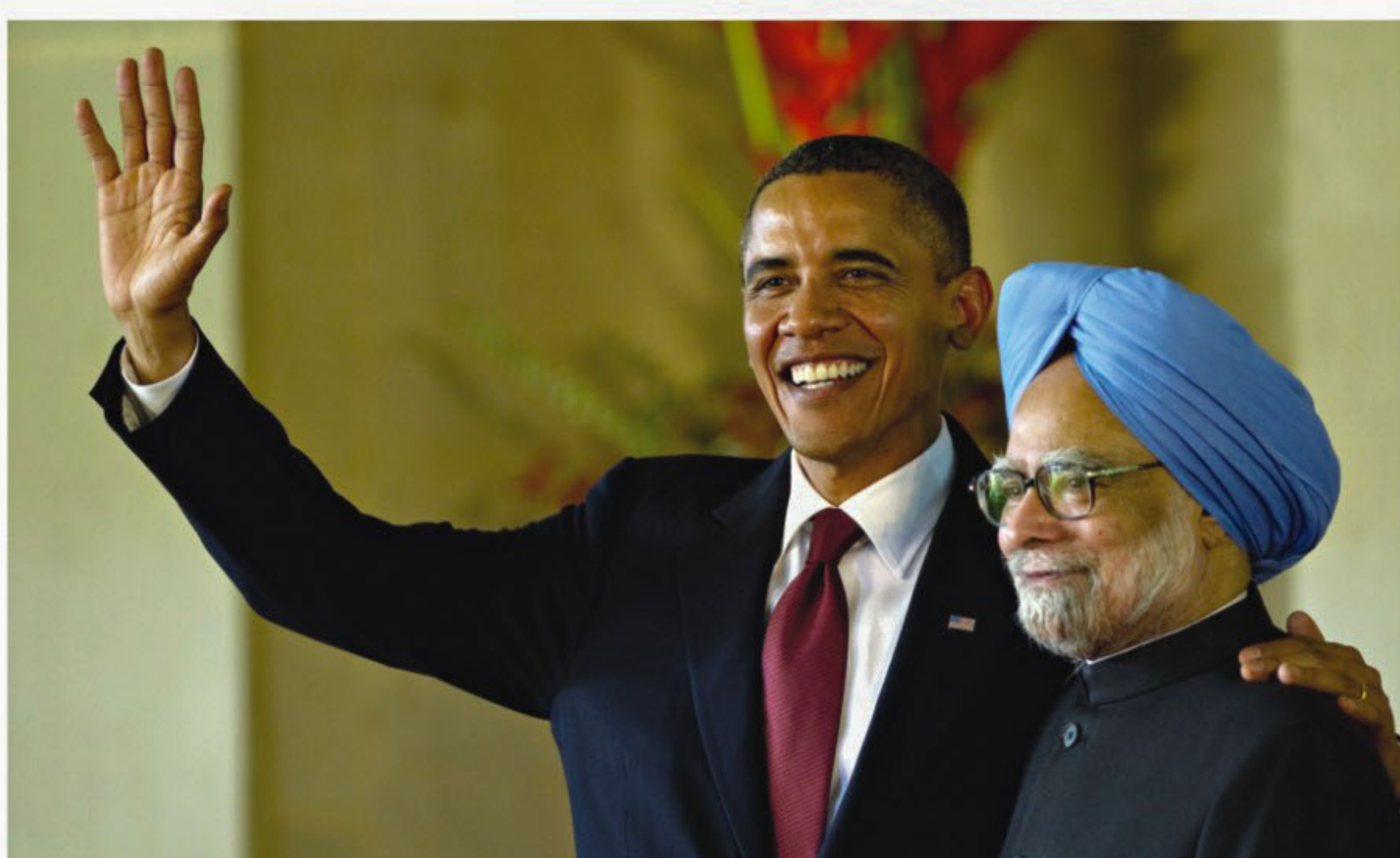
US President Barack Obama waves with India Prime Minister Manmohan Singh after addressing a joint press conference at Hyderabad House in New Delhi yesterday.