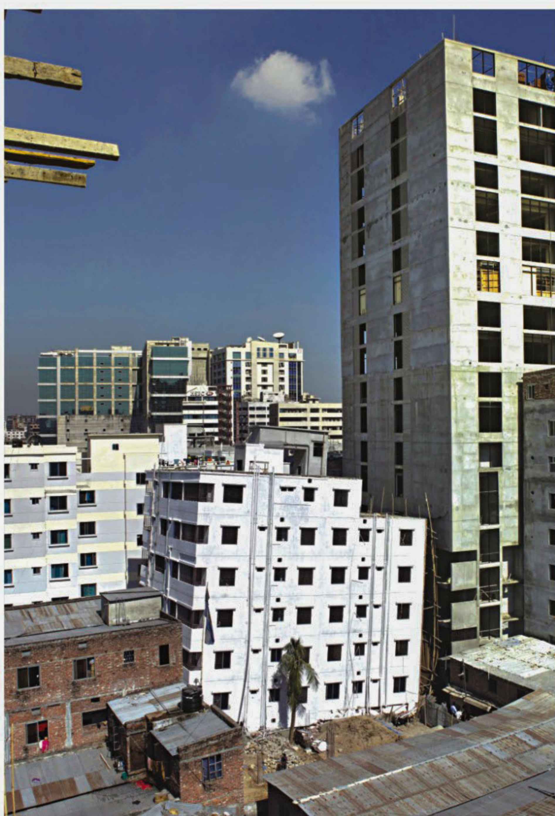
Views from different angles around the seven-storey building at Kathalbagan in the city that tilted and sank by about 10 feet into the ground on Sunday night. Hundreds of people thronged the area all day to get a glimpse of the building while nearby residents were seen leaving for safe places.