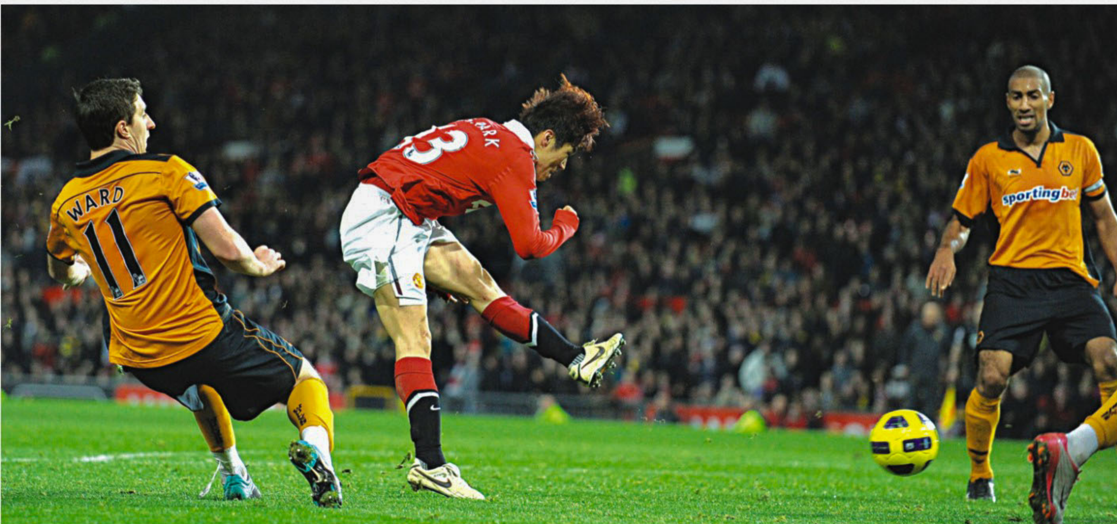
Manchester United midfielder Park Ji-Sung (2nd from L) scores the late winner during their Premier League match against Wolves at Old Trafford on Saturday.