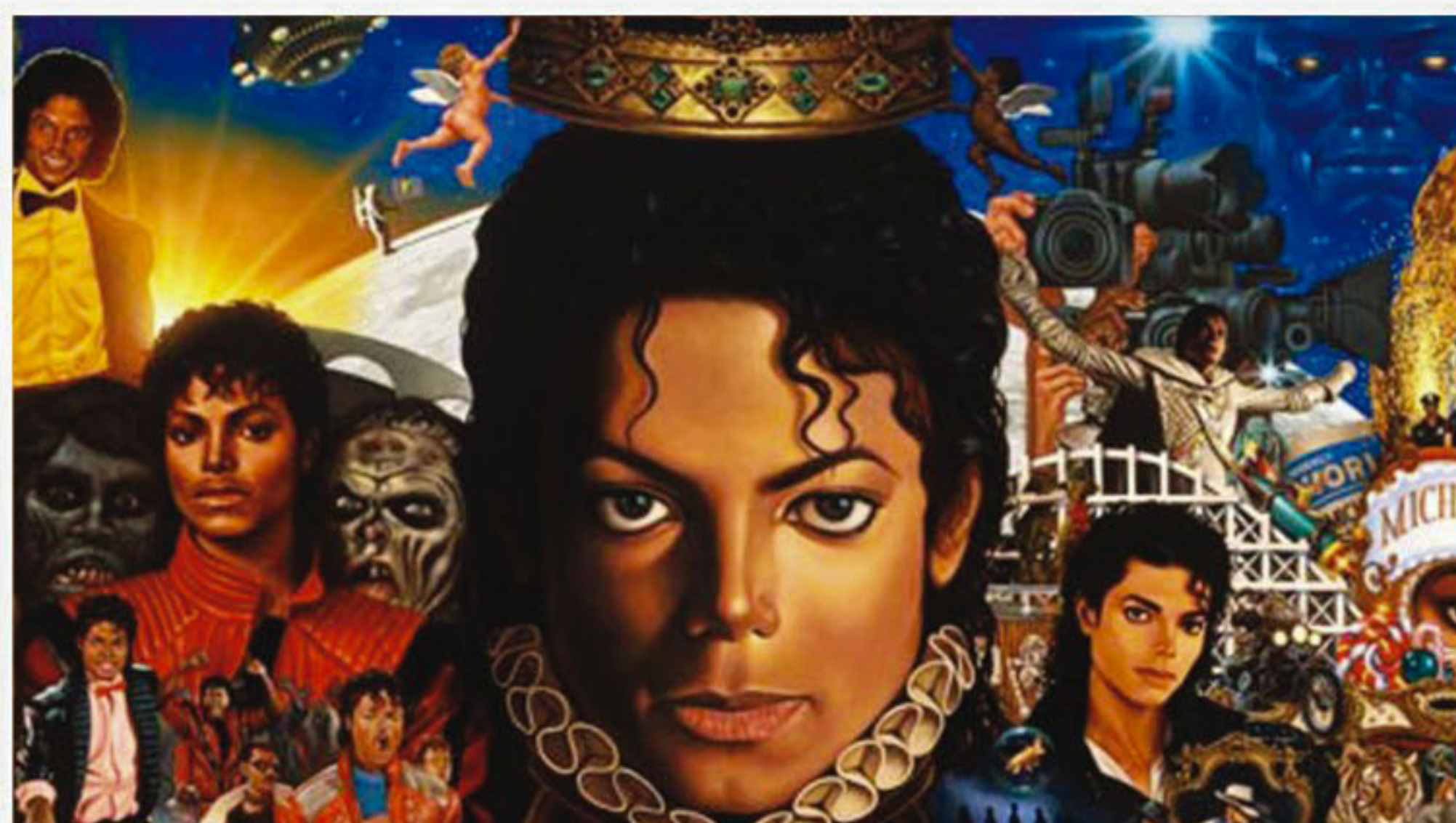
Detail from the Kadir Nelson cover painting for Michael Jackson's new album, "Michael".