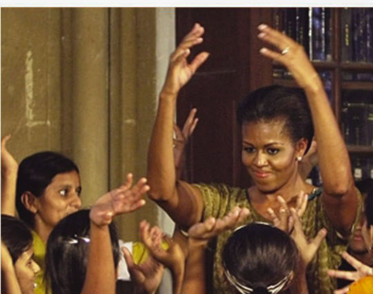
US First Lady Michelle Obama danced barefoot to Bollywood tunes as she visited a charity in Mumbai.