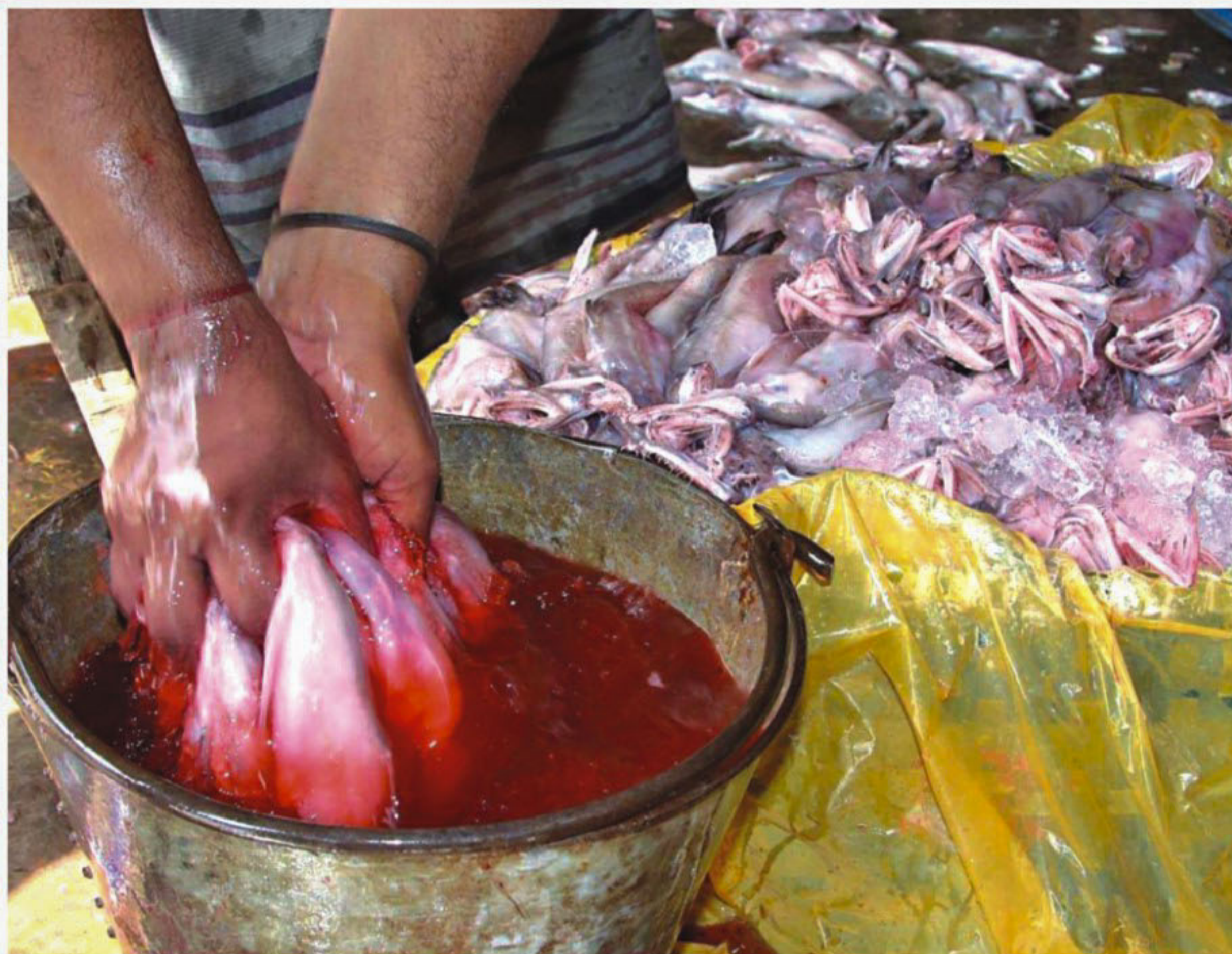
Fresh laitya fishes caught in the Bay being dipped in dye so that they look attractive and could be sold at higher price. Despite government attempts to provide people with unadulterated consumables, an unscrupulous group of traders continue to cheat consumers and sell food that are harmful. The photo was taken at Patharghata Fisheryghat in Chittagong yesterday.

Cooperation" was organised by Palli Karma-Sahayak Foundation and held at Bangabandhu International Conference Centre. Speaking as chief guest, Foreign Minister Dipu Moni said since the signing of the Ganges Treaty in 1996, it is taking so long to strike a treaty on the sharing of Teesta water. If the pace of talks remains the same, it will take a millennium to reach agreements on all the 54 trans-boundary rivers. She mentioned that 10 percent of the world population live only in 1.2 percent of the global landmass in this region. And it is home to 40 percent of the world's poorest people. "So, we need to change our mindset," she said. The foreign minister went on, "We have to go beyond the narrow and shallow national interests for the sake of attaining sustainable development and managing the common heritage of the people of this region." Referring to the on-going talks on the Teesta