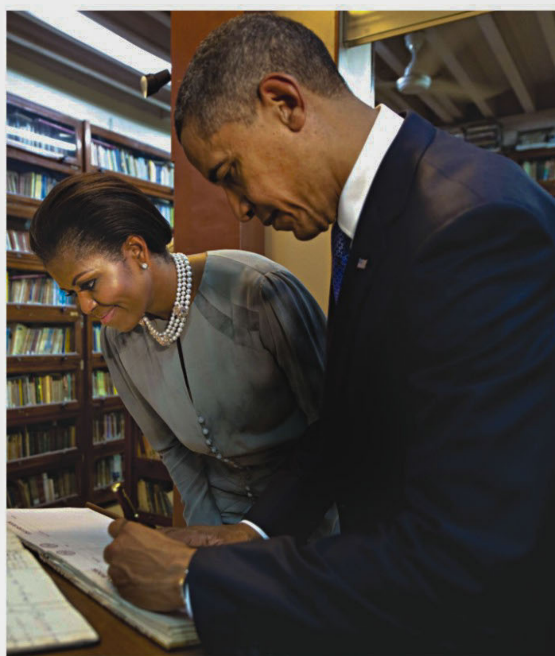
US President Barack Obama (R) and First Lady Michelle Obama (L) write in the visitor's book during their tour through the Mani Bhavan Gandhi Museum in Mumbai yesterday. President Obama arrived in India's financial capital along with his wife Michelle, for a two-day visit of his Mumbai leg of the India trip.

Many shoppers who went to purchase their stock of crackers, gifts and items for weekend celebrations of the Hindu festival of Diwali returned home with a pack of Obama posters.