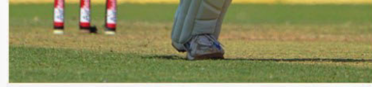
India's Harbhajan Singh takes a run during his career-best 69 against New Zealand on the second day of the first Test at the Sardar Patel Gujarat Stadium in Ahmedabad yesterday.