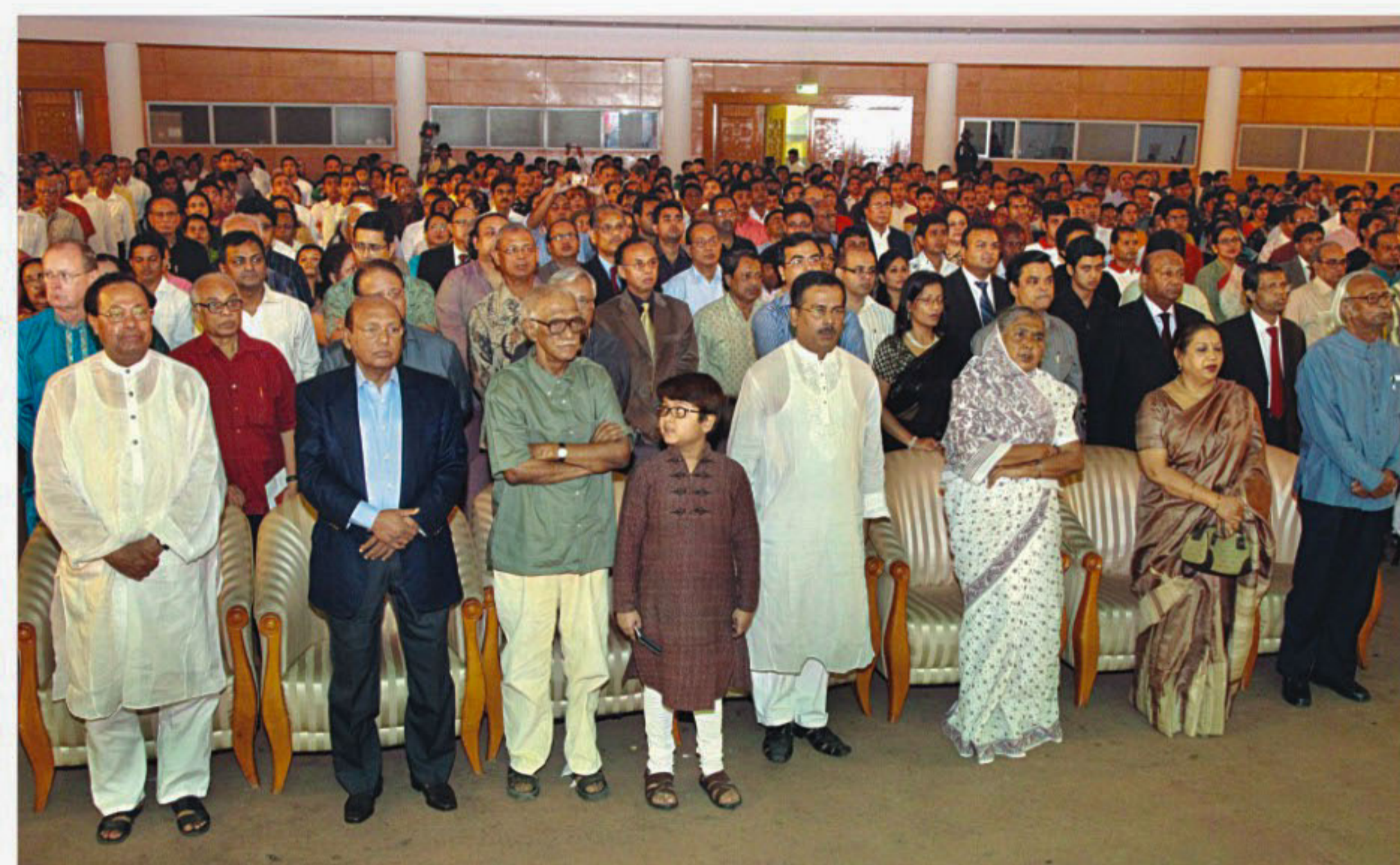
Dignitaries stand as the national anthem is played ahead of a cultural programme marking the 12th birth anniversary of Bangla daily Prothom Alo at the Bangabandhu International Conference Centre yesterday.

The explosion occurred in Darra Adam Khel, an area near Pakistan's tribal regions where Taliban-led militants have been active. Hundreds of worshippers had gathered at the Sunni mosque Friday afternoon for the most popular prayer session of the week. The mosque's roof caved in, trapping people in debris. People in private vehicles rushed the wounded to hospitals in Peshawar, the main city in the northwest, TV footage showed. A woman was beating her head, while two elderly men in blood-soaked clothes lay in a SEE PAGE 15 COL 7