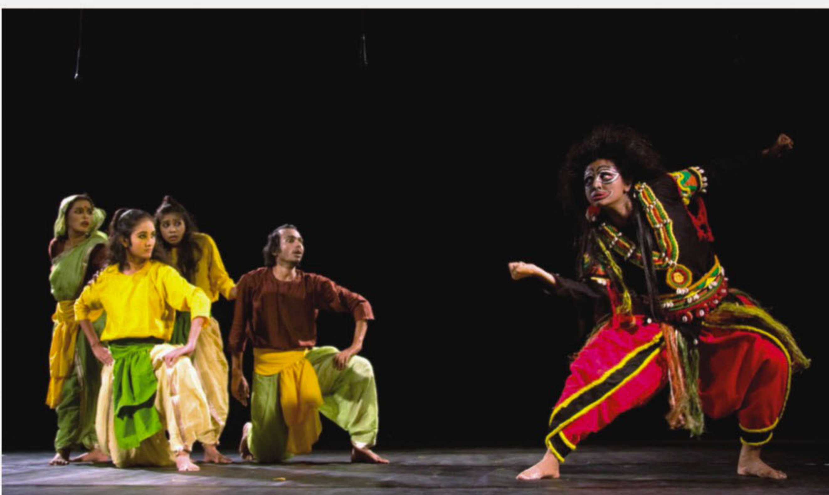
"Madhyambyaog", originally written by Sanskrit playwright Bhasha, narrates a story from the epic "Mahabharat".