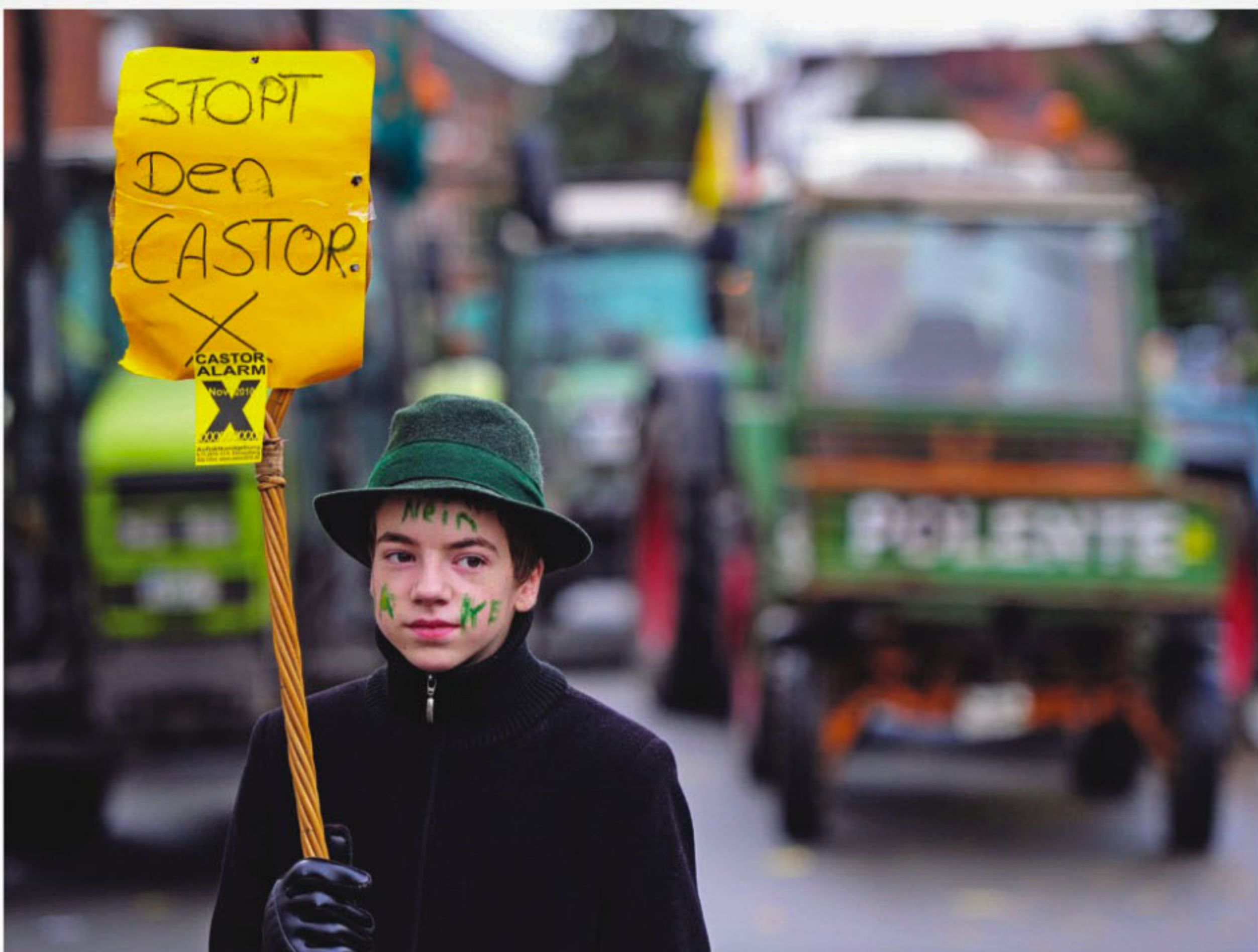
A boy with an anti nuclear poster attends a demonstration by pupils from a local school against nuclear waste storage yesterday in Luechow, northern Germany. Protests are planned against the upcoming Castor transport of nuclear waste to the storage facility in a salt deposit in Gorleben scheduled for this weekend.