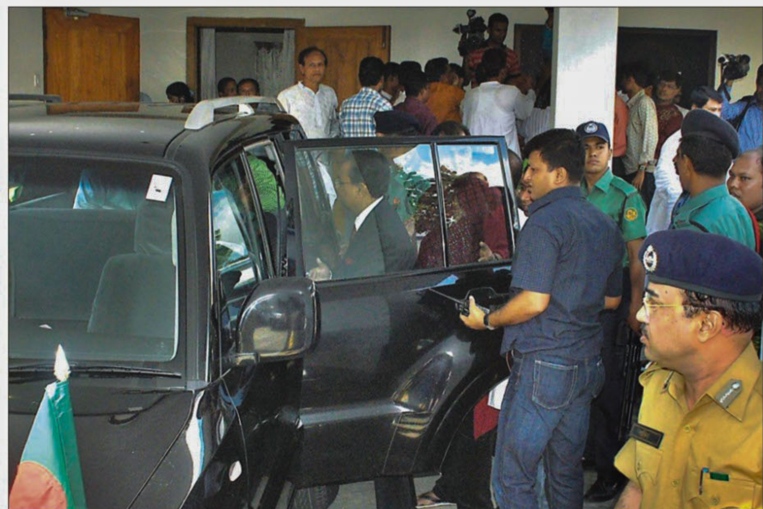
Communications Minister Syed Abul Hossain hurriedly leaves Railway Officers' Rest House in Chittagong yesterday while Railway Sramik League activists were still manhandling the journalists.