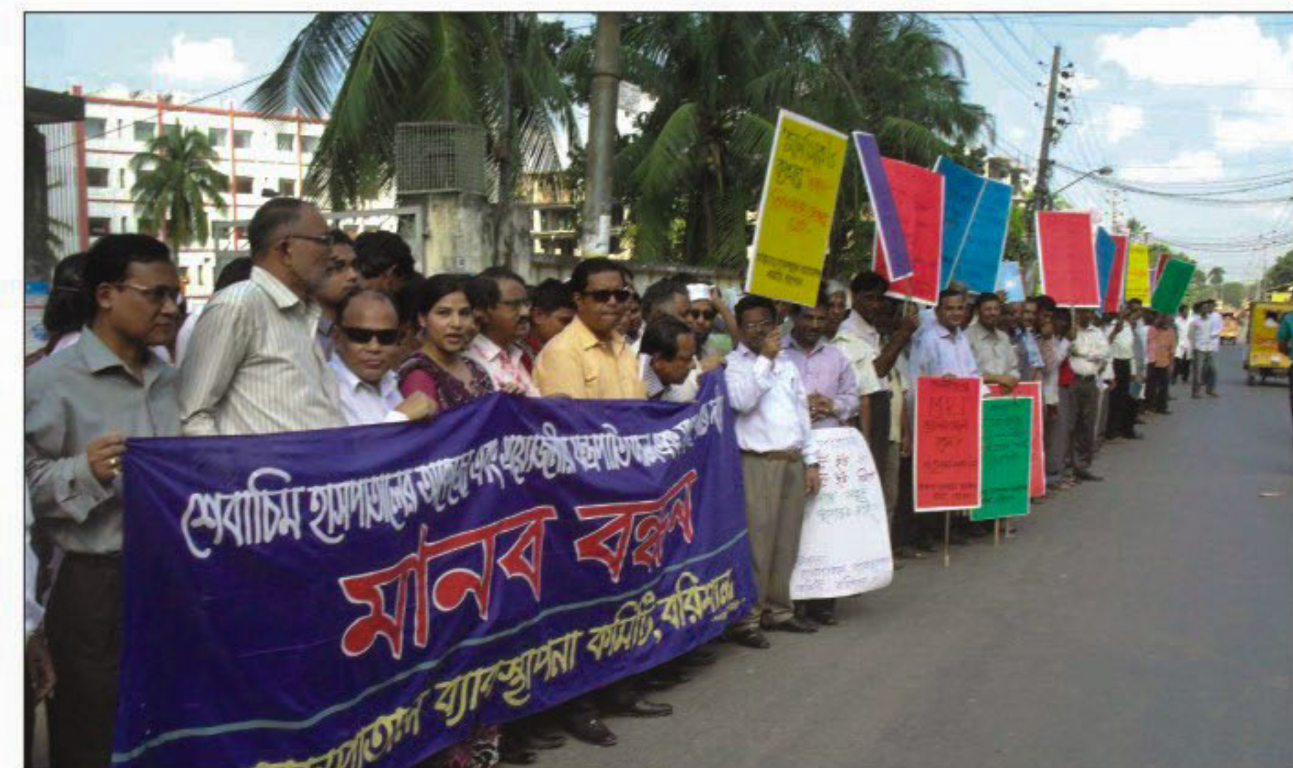
Doctors, nurses, students and staff of Barisal Sher-e-Bangla Medical College and Hospital form a human chain on the campus yesterday demanding arrangement of modern equipment and appointment of sufficient manpower to ensure quality service at the region's largest medical service provider organisation.