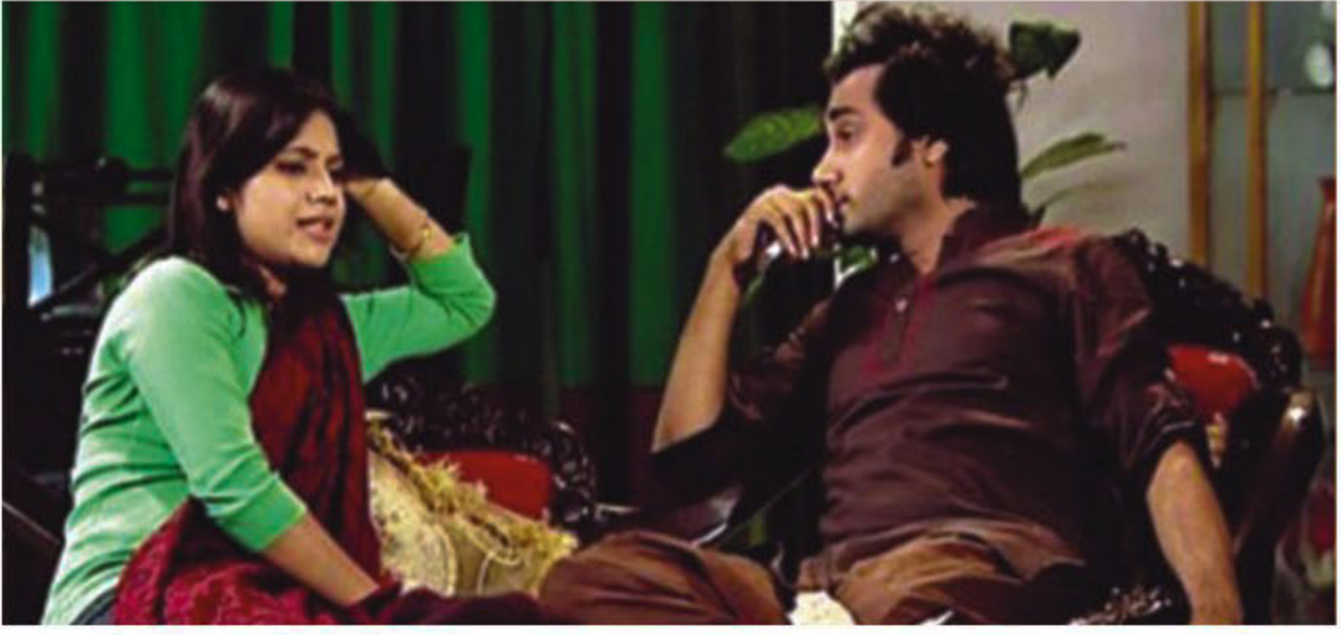
A scene from the serial.