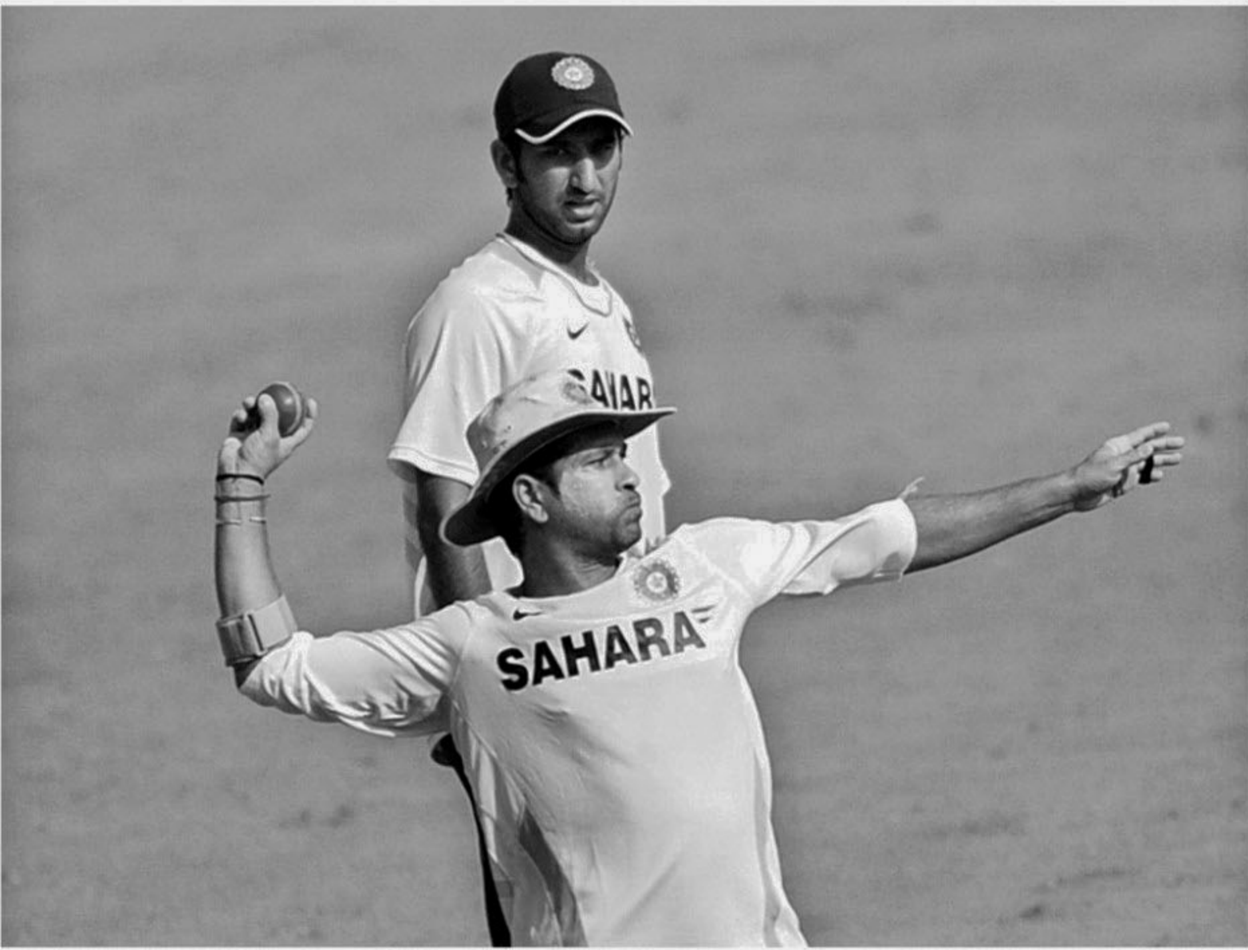
India's master batsman Sachin Tendulkar throws a ball as his teammate Cheteshwar Pujara looks on during a practice session at Sardar Patel Stadium in Ahmedabad yesterday.