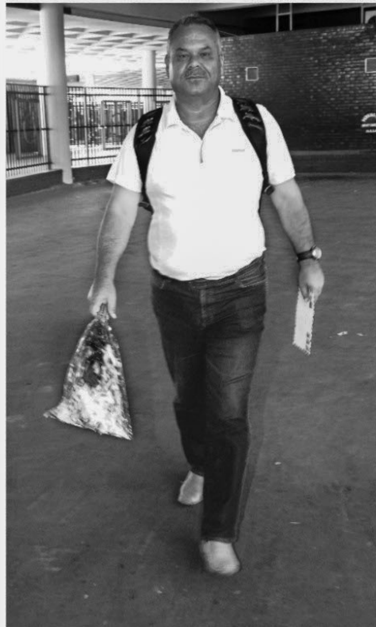
Former Bangladesh coach Dav Whatmore arrives at the Hazrat Shahjalal International Airport in the capital yesterday.

NEW ZEALAND (from): Daniel Vettori (captain), Ross Taylor, Brendon McCullum, Jesse Ryder, Martin Guppill, Gareth Hopkins, Kane Williamson, Chris Martin, Tim Southee, Tim McIntosh, Jeetan Patel, Brent Arnel, Bradley John Watling, Hamish Bennett and Andy McCay.