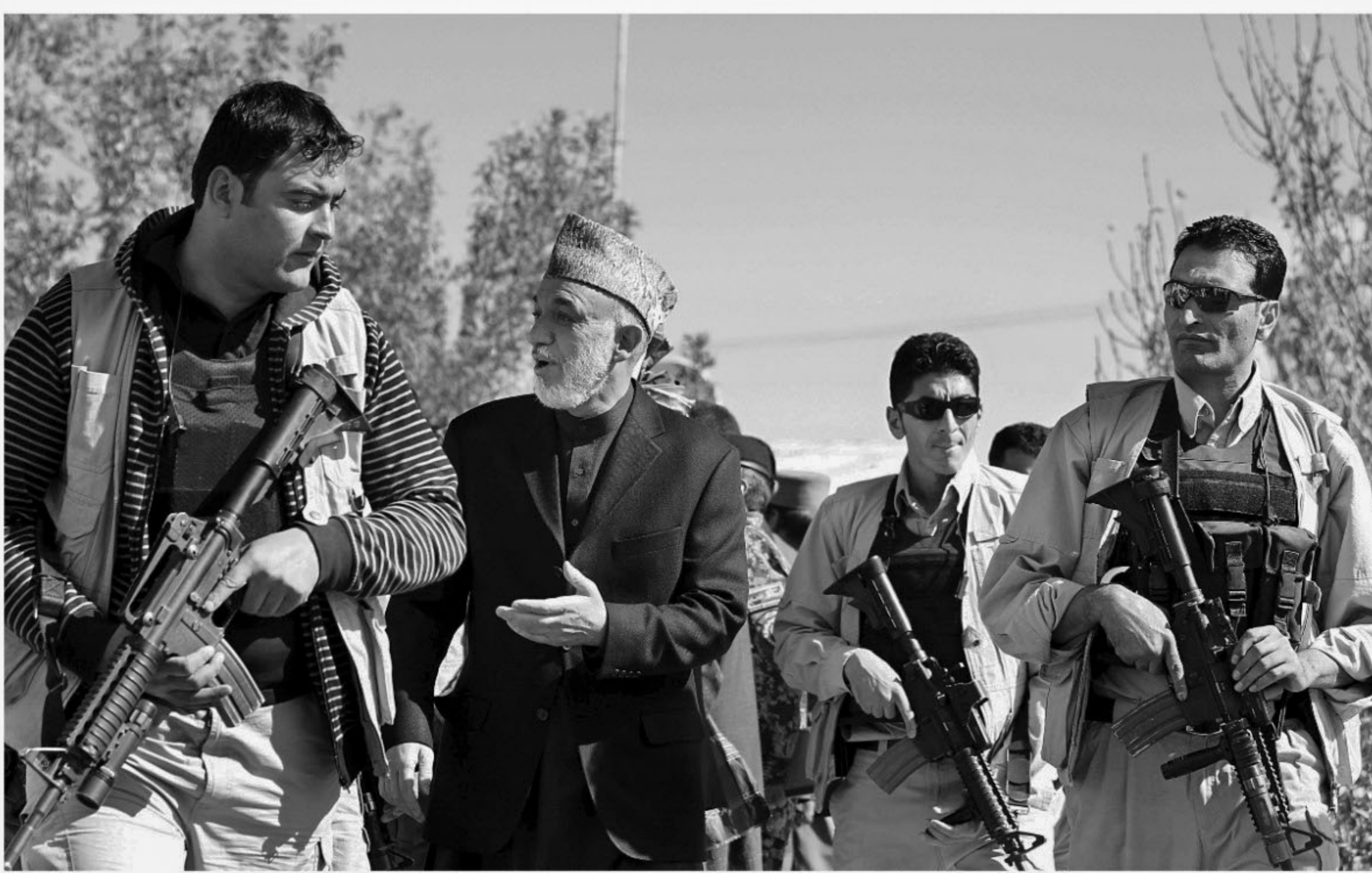
Afghan President Hamid Karzai (2L) is escorted by security personnel as he arrives to deliver a speech in Paktika province on Tuesday.

Anti-India sentiment runs deep in the majority Muslim region, where more than a dozen rebel groups have been fighting for Kashmir's independence or its merger with neighbouring Pakistan since 1989.