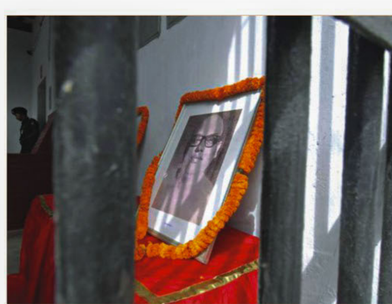
Garlands are placed around the photographs of the four slain national leaders kept inside the prison cell they were confined to at Dhaka Central Jail. The place of their murder has recently been turned into a museum. The photo in focus is of Syed Nazrul Islam. The nation observes jail killing day today. On this day in 1975, national leaders Syed Nazrul Islam, Tajuddin Ahmad, AHM Qamaruzzaman and Capt Mansur Ali were killed.