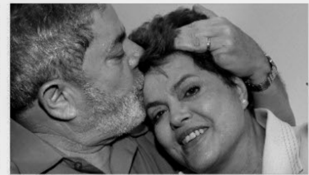
Handout picture released yesterday shows Brazilian President Luiz Inacio Lula da Silva (L) kissing Brazilian President elect Dilma Rousseff as they celebrate her victory at Alvorada Palace.

Rousseff picked up 56 percent of the vote to Serra's 44 percent, according to an official tally of all ballots by the