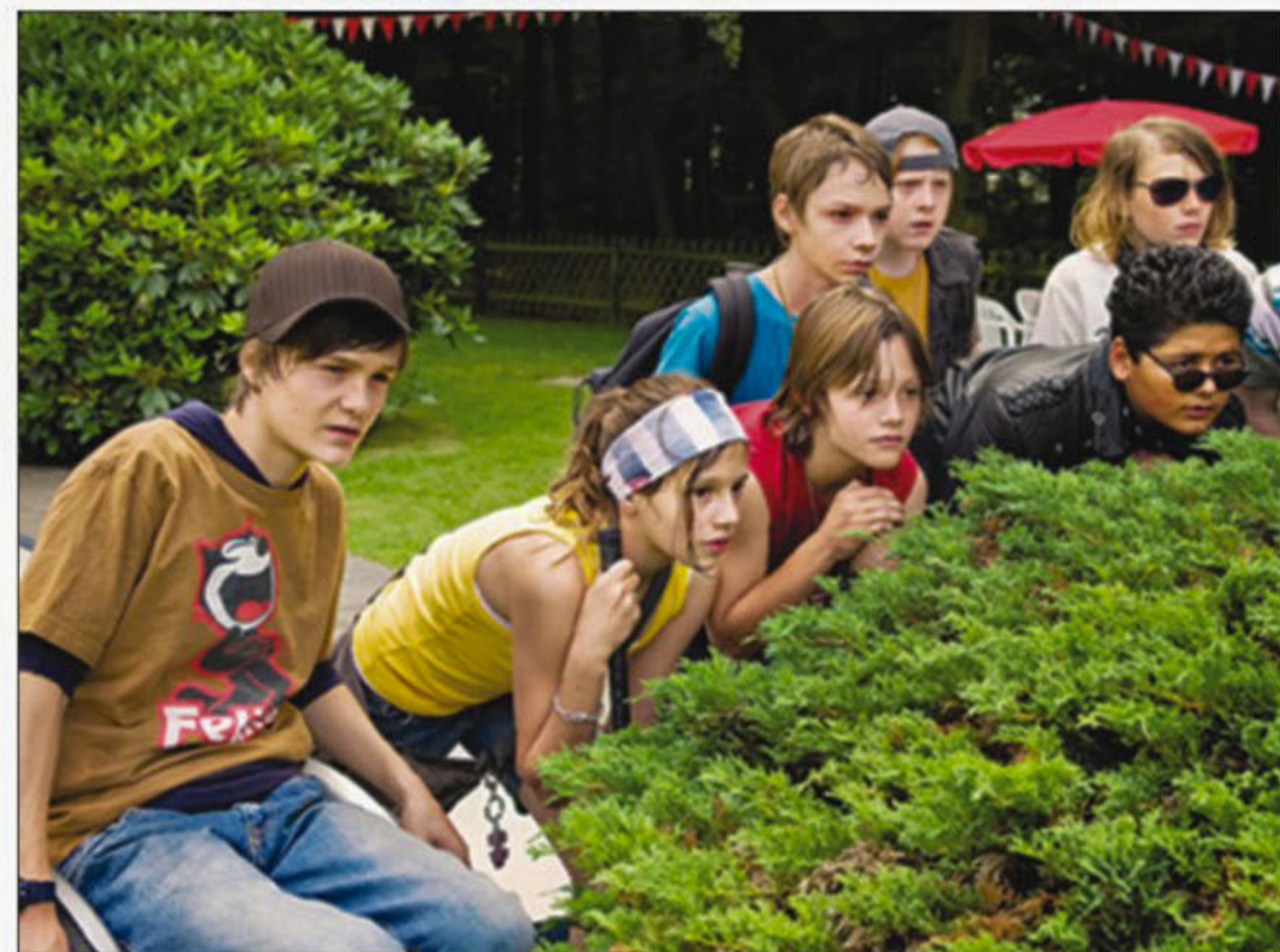
A scene from the film "The Crocodiles".

After the screening of each film, the audience is invited to participate in a lively discussion and the participants also get the opportunity to win prizes in a special quiz dealing with the selected film topics.