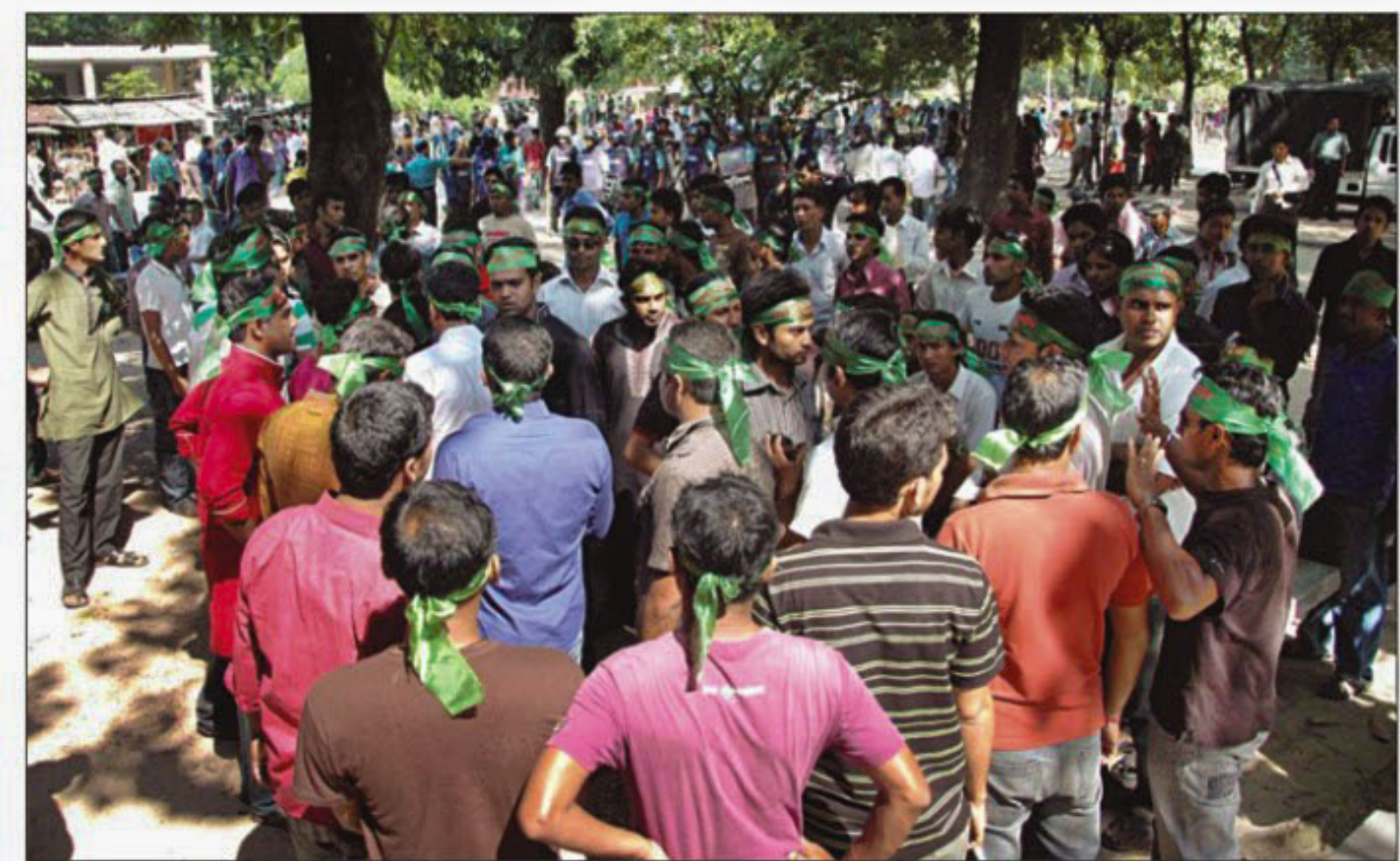
Defying restriction orders of the authorities, two factions of Bangladesh Chhatra League hold political programmes and chase each other on Rajshahi University campus yesterday, creating panic, especially among the candidates of first year admission test.

Constant electricity supply enables solar power users run lights and fans at homes and enjoy TV programmes. They can know more about the country, the government activities as well as about the world while students can better attend to their study.