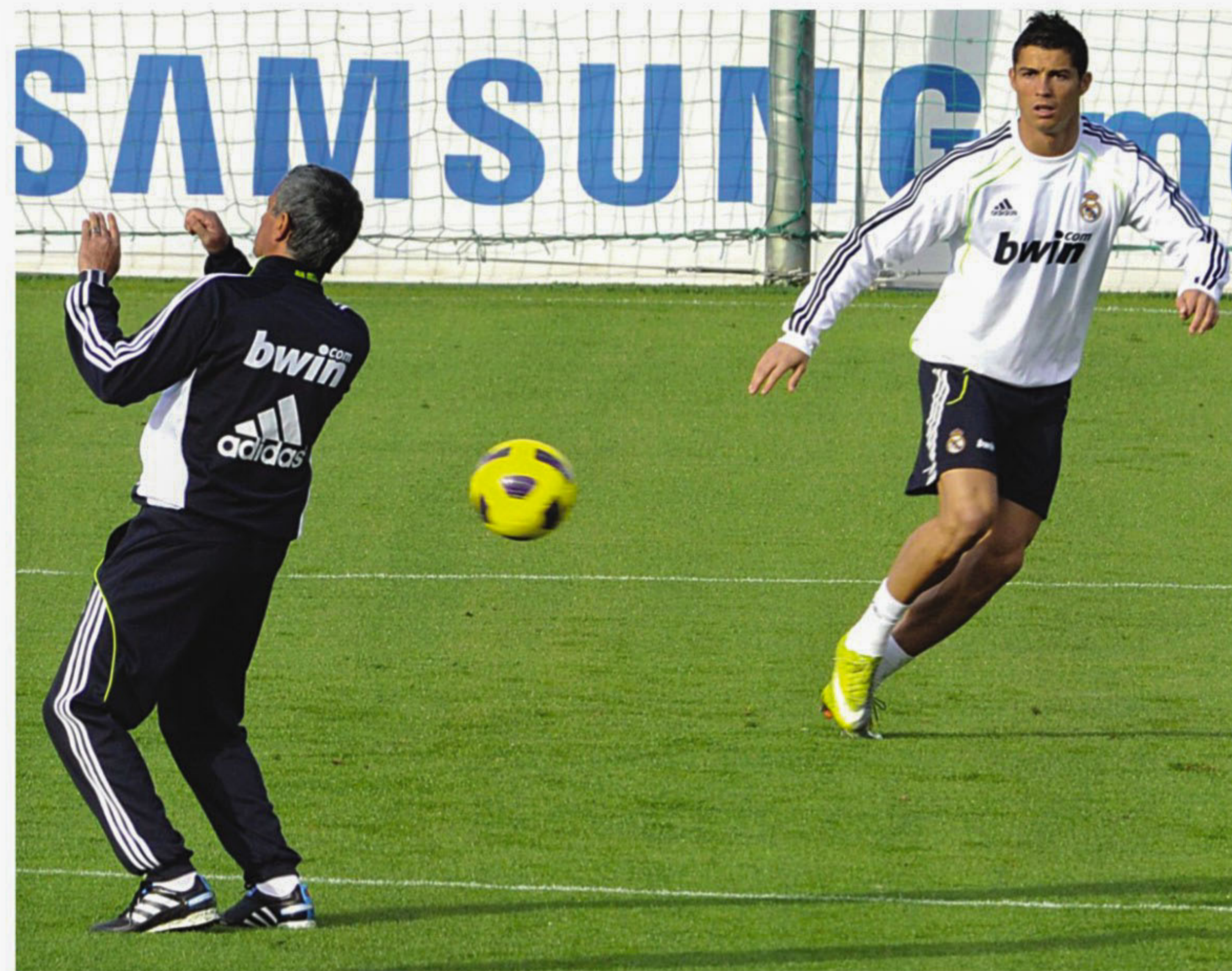
Real Madrid coach Jose Mourinho (L) takes evasive action against a Cristiano Ronaldo shot during a training session at sport city yesterday.