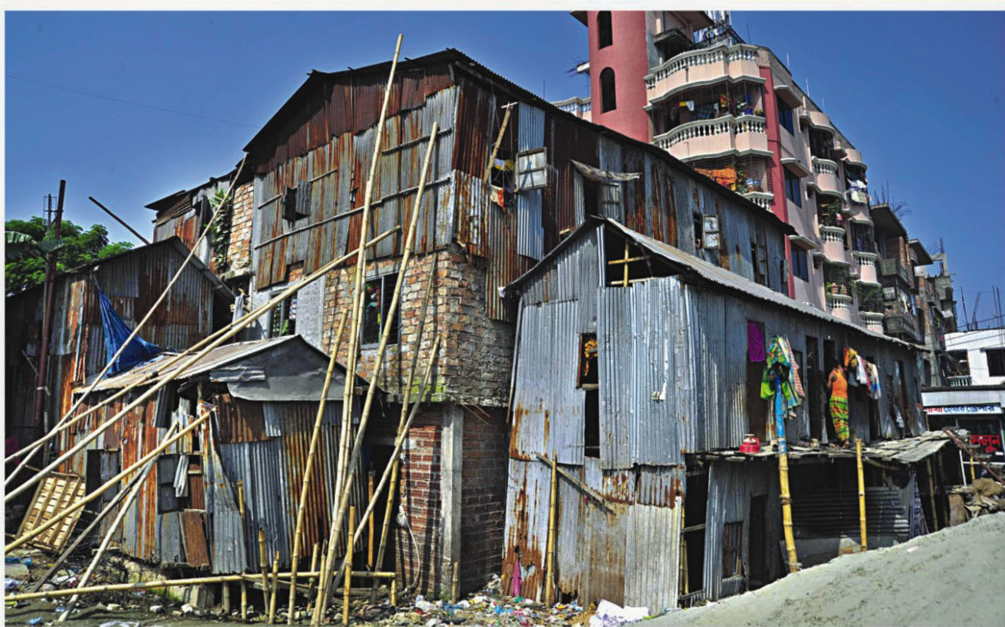
A four-storey structure of wood and corrugated sheet in the capital's Begunbari at a risk of collapse. In recent months, collapse of similar structures claimed many lives in the area. The photo was taken yesterday.