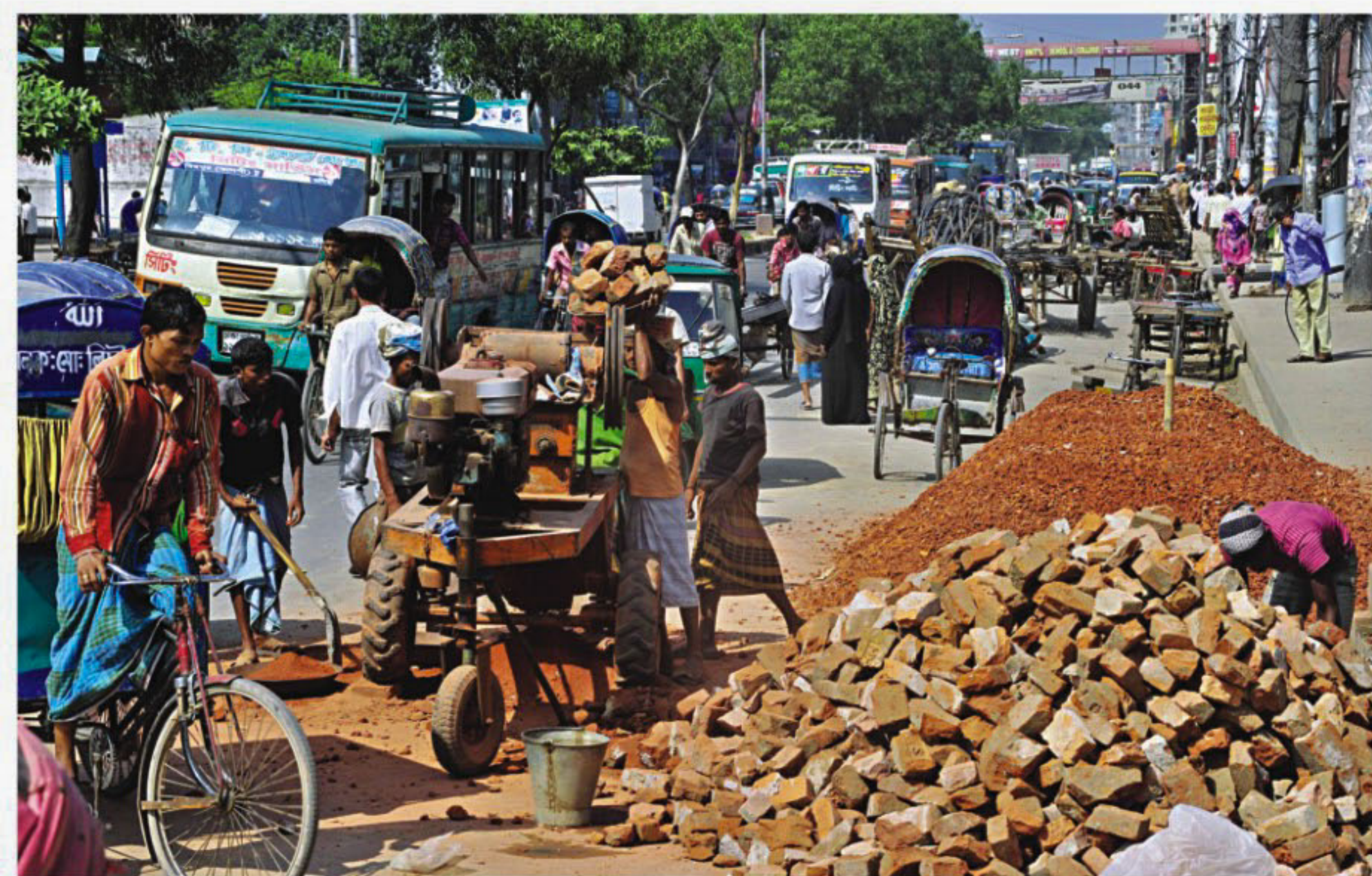
Piled up construction materials of a commercial building narrows the Rokeya Sarani in the capital's Mirpur. The photo was taken yesterday.

Please cast your vote at www.thedailystar.net