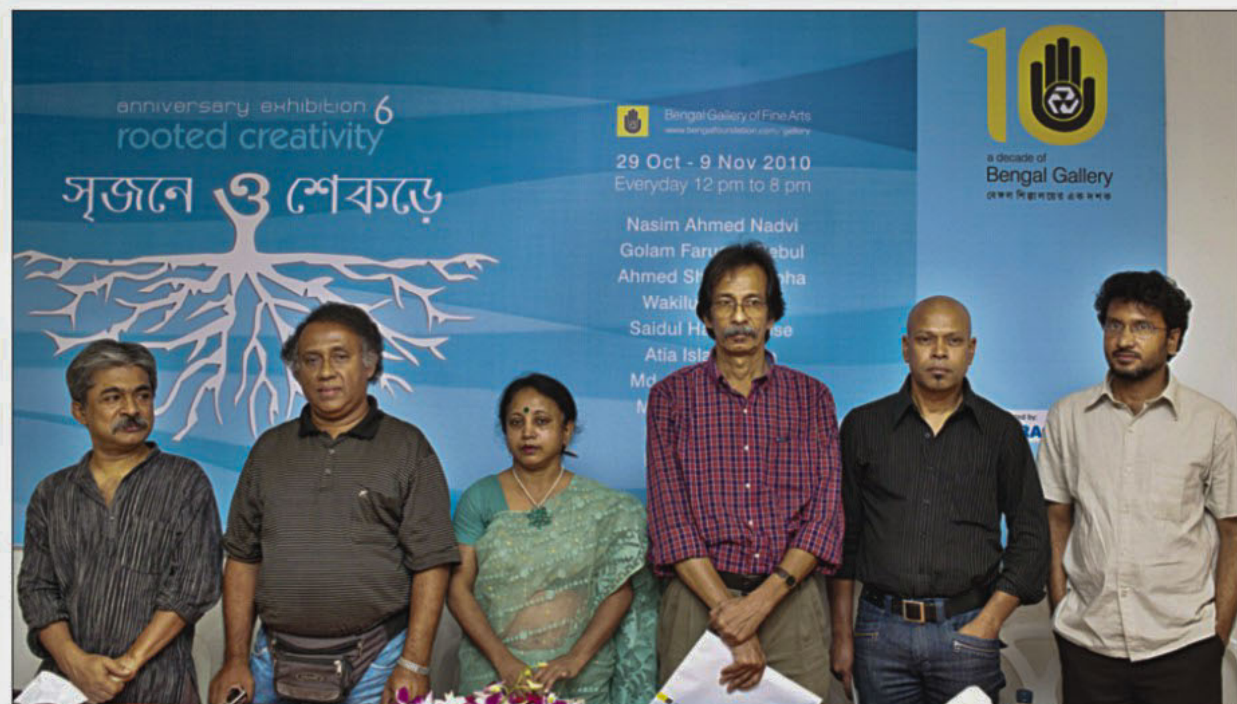
Participating artists at the press conference.