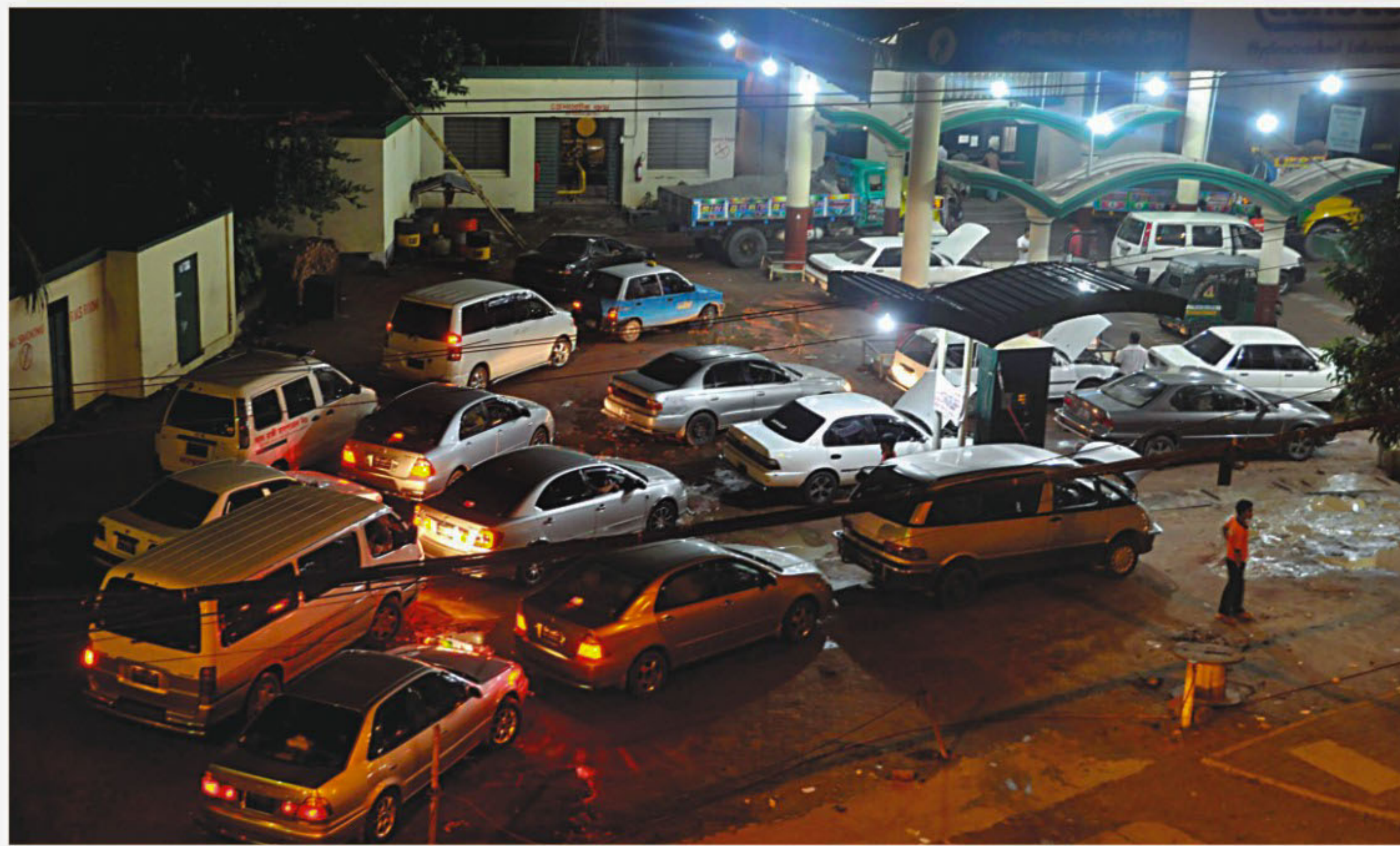
It's around 1:30am and cars still keep queuing at a CNG station of the capital's Mohakhali for refilling. As the city's gas pumps are kept closed from 3:00pm to 9:00pm in compliance with a government order, the daytime rush has been shifted to night. The photo was taken recently.