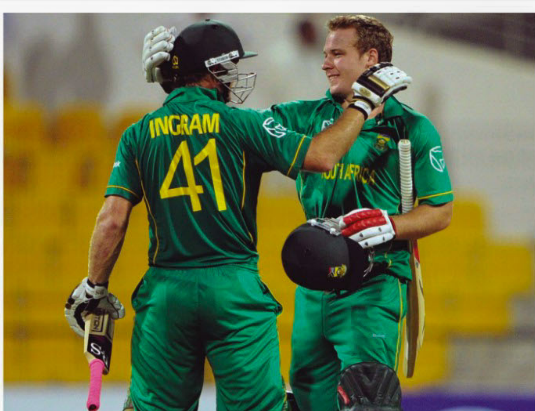
South Africa's Colin Ingram (L) and teammate David Miller celebrate after beating Pakistan in their first Twenty20 clash at the Abu Dhabi Cricket Stadium on Tuesday. South Africa won the match by six wickets.

It was learnt that the higher authorities have also given the cold shoulder about any changes in the constitution because it will also limit the power of the BCB president.