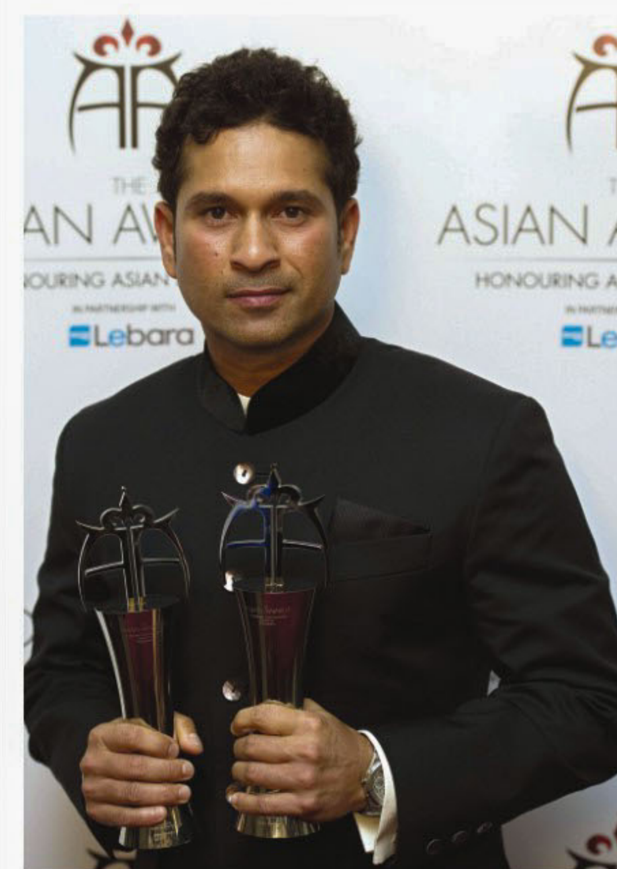
India's superstar cricketer Sachin Tendulkar poses for photographs after receiving People's Choice award for outstanding achievement in sport at the Grosvenor House Hotel in central London on Tuesday.

"To receive an accolade from your peers is one thing, but to receive acknowledgment from the public is the ultimate honour. Thank you to all those who voted for me," he said.