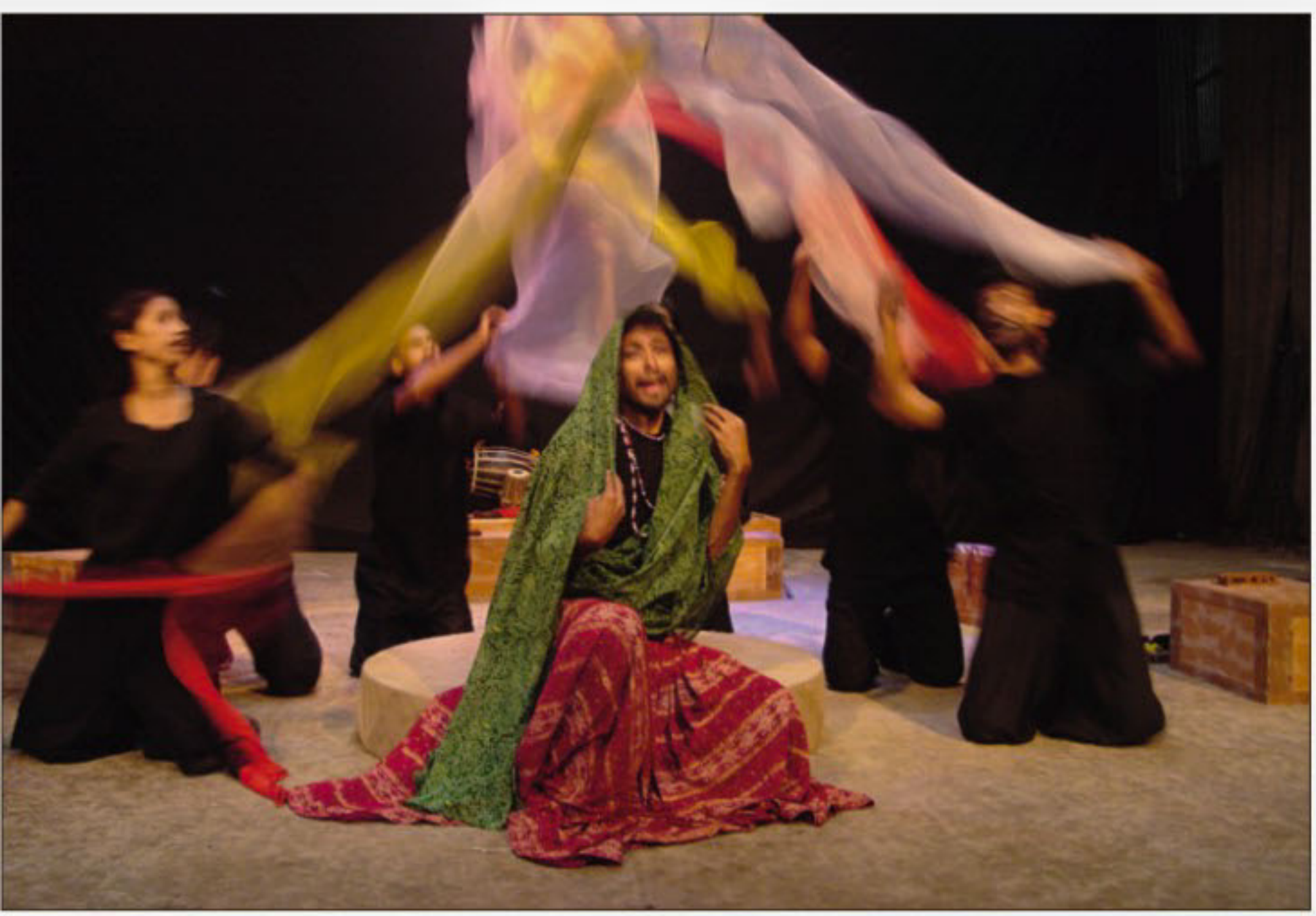
A scene from "Bhelua Sundari".