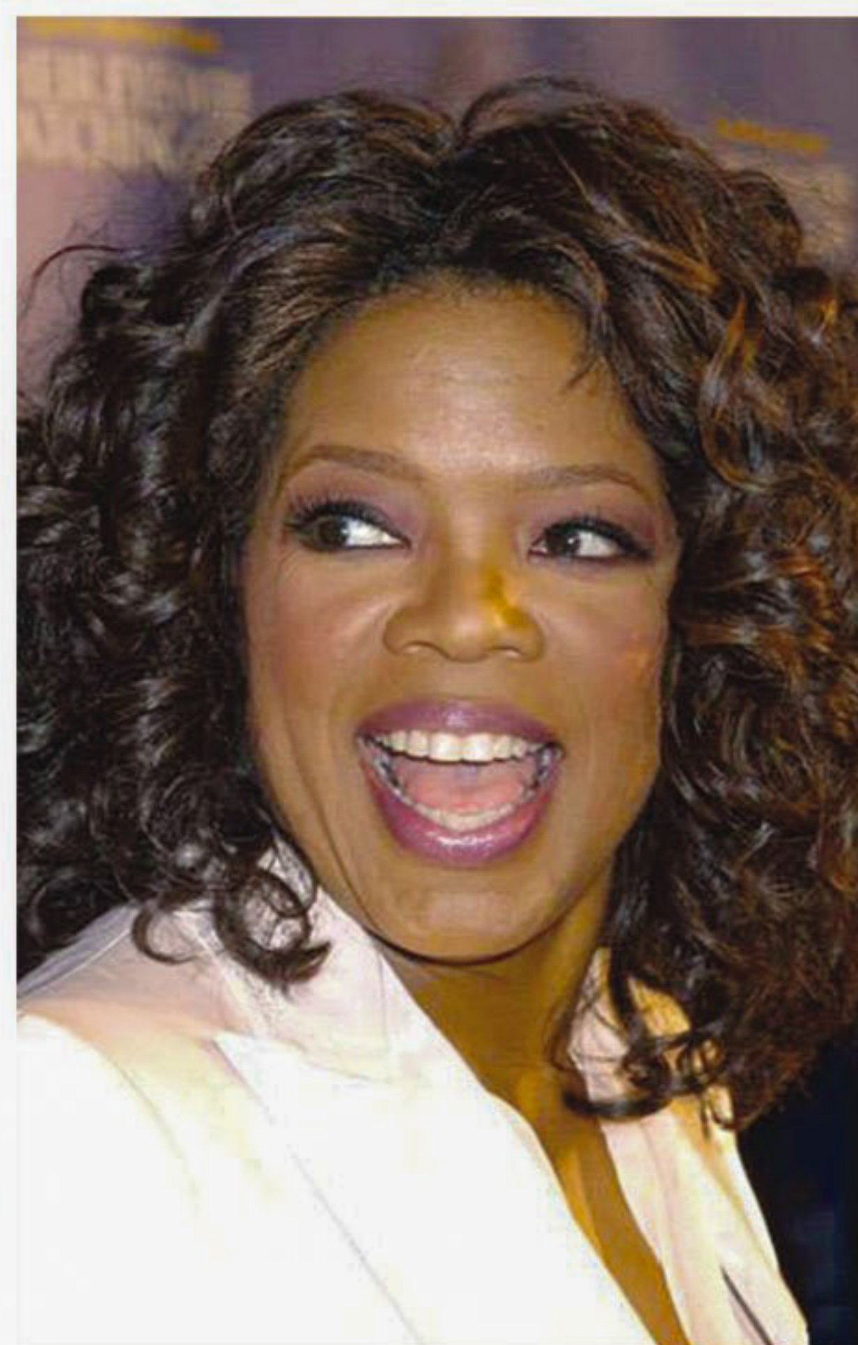
Oprah Winfrey show on OWN.