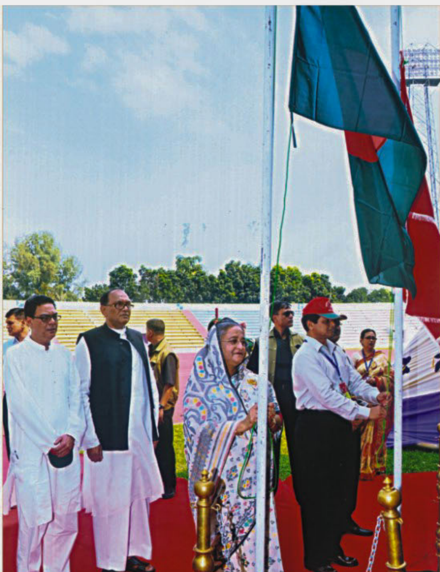
Prime Minister Sheikh Hasina inaugurates the installation and oath-taking ceremony of Bangladesh Freedom Fighters' Central Command Council-District and Upazila Commands at the Bangladesh Army Stadium in the city yesterday.