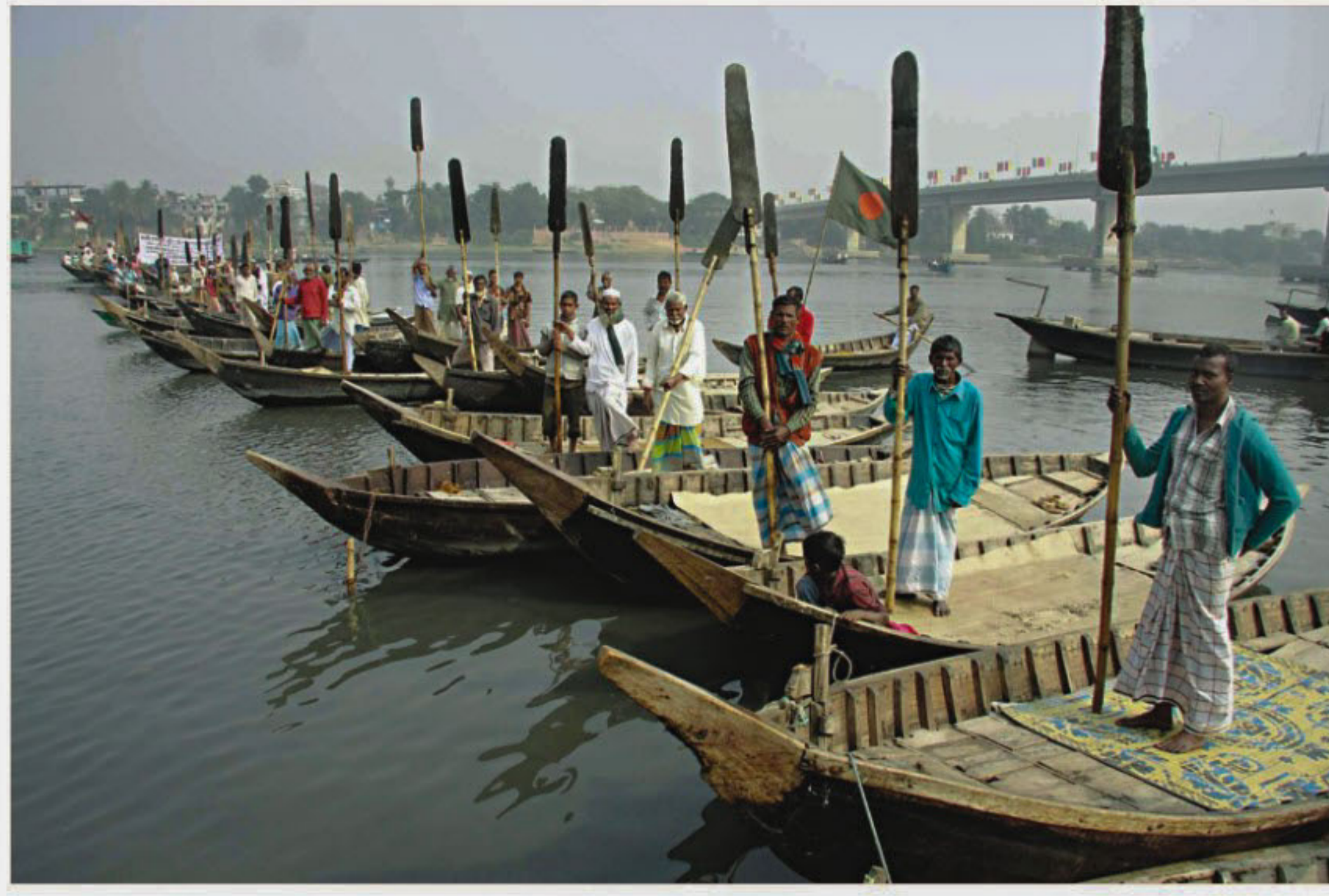
Boatmen from Basila-Waspur Ghat held a rally in the Buriganga River near the newly constructed Shaheed Buddhijibi Bridge on December 29 last year, inaugural day of the bridge, demanding compensation.

In the afternoon of December 29 last year, about 150 traditional boatmen from the Basila-Waspur Ghat formed a spectacular column with their boats in the river Buriganga and waited under the just completed Shaheed Buddhijibi Bridge there.